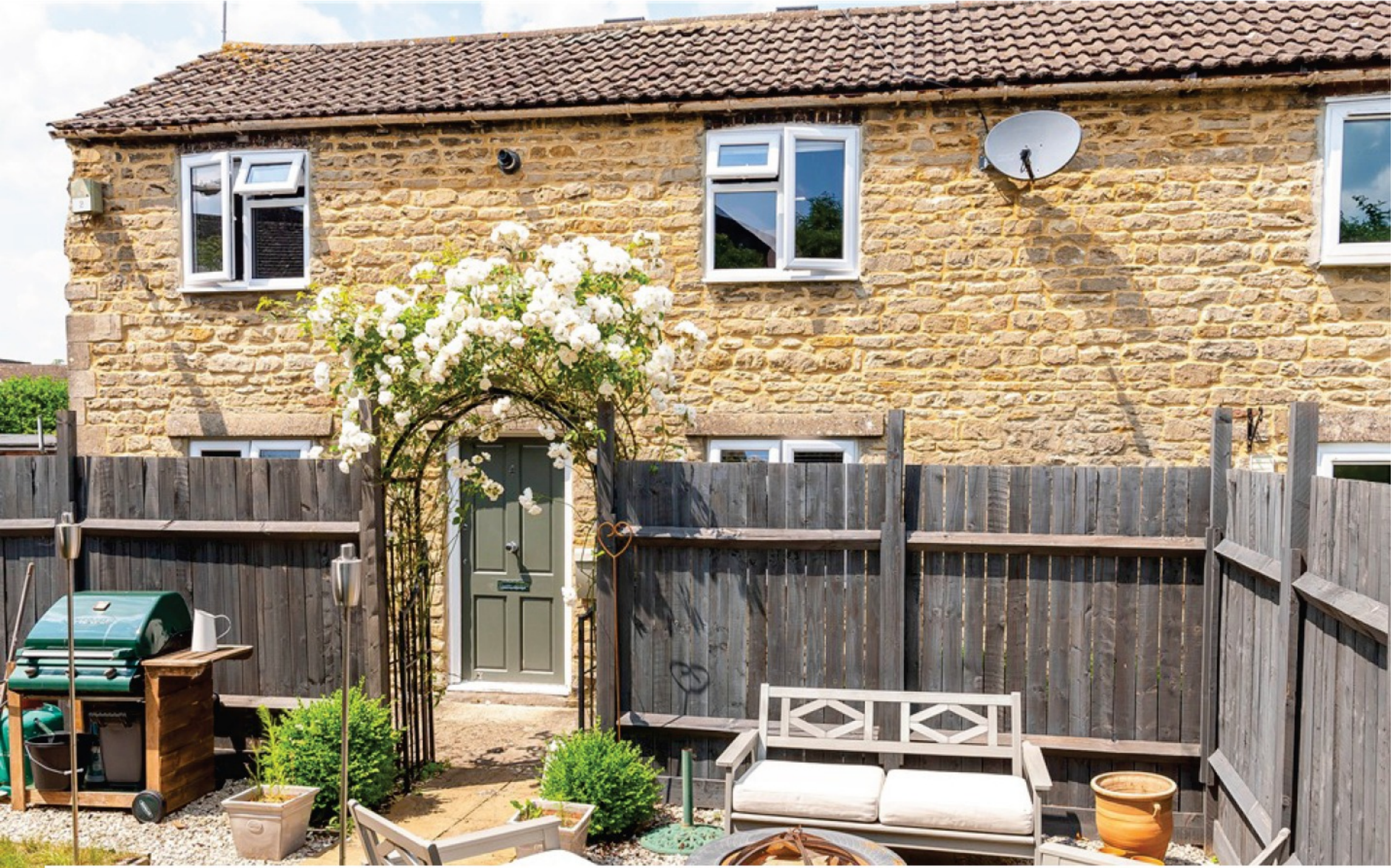
Lowell Place, Witney