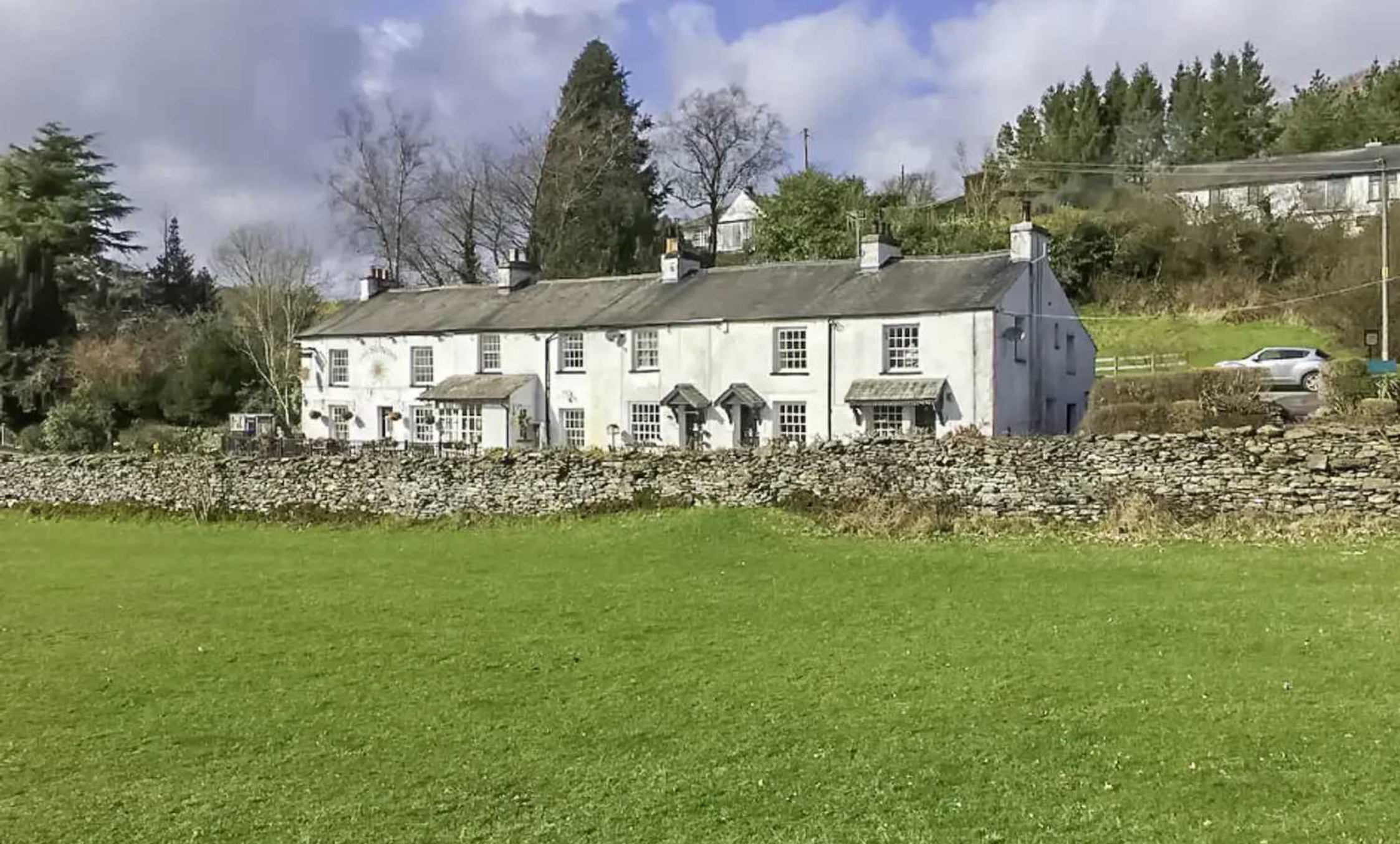
2 Sun Inn Cottages, Crook £285,000