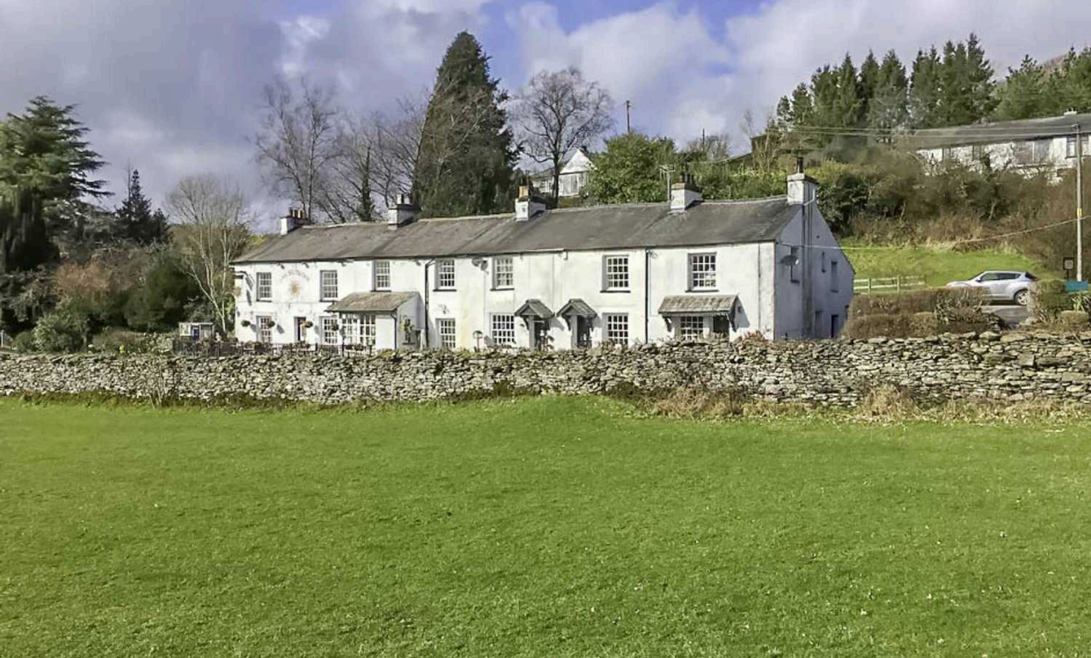
2 Sun Inn Cottages, Crook £285,000