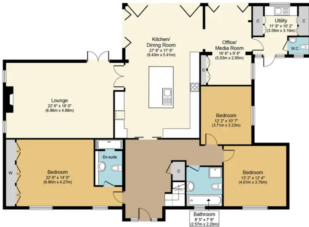
Ground Floor Approximate Floor Area 2,045 sq. ft. (190.0 sq. m.)