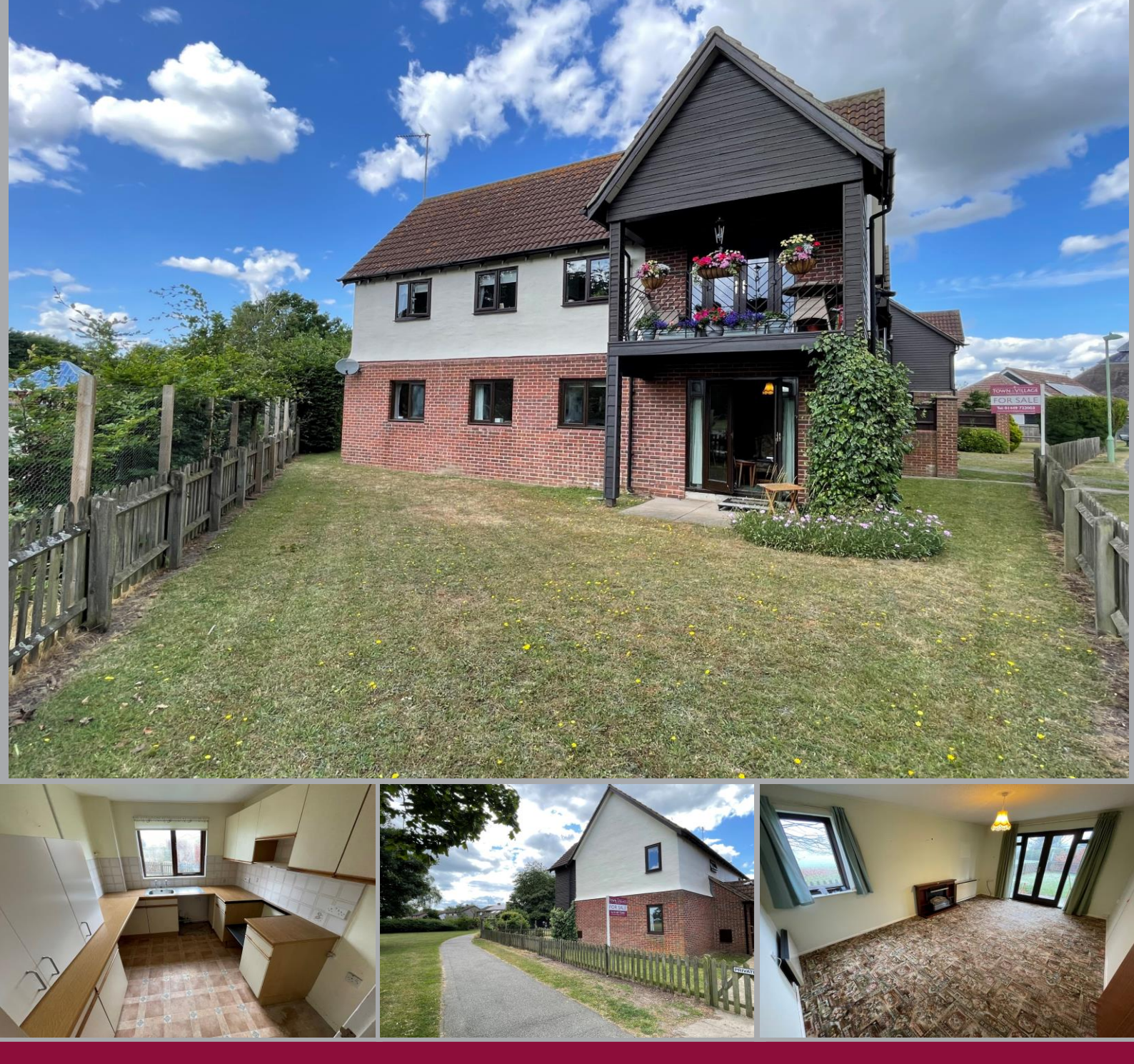
31 Bader Court | Martlesham Heath | Ipswich | IP5 3UY

Specialist marketing for | Barns | Cottages | Period Properties | Executive Homes | Town Houses | Village Homes