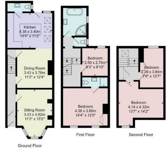
Total Area: 125.5 m² ... 1350 ft² All measurements are approximate and for display purposes only. No liability is accepted by either the agency or Box Property Solutions Ltd as to the exact measurements of the rooms. Box Property Solutions Ltd retains the copyright on this plan and allows agents to use it with agreed permission.