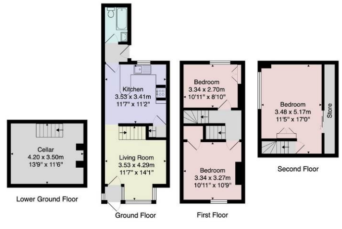
Total Area: 94.1 m² ... 1013 ft² All measurements are approximate and for display purposes only. No liability is accepted by either the agency or Box Property Solutions Ltd as to the exact measurements of the rooms. Box Property Solutions Ltd retains the copyright on this plan and allows agents to use it with agreed permission.