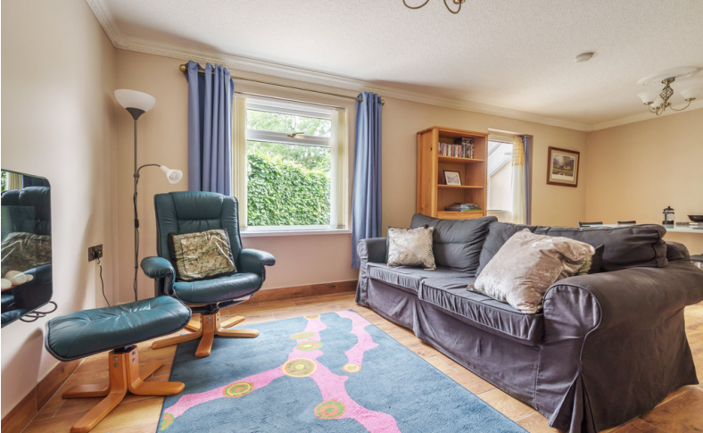
Living / Dining Room