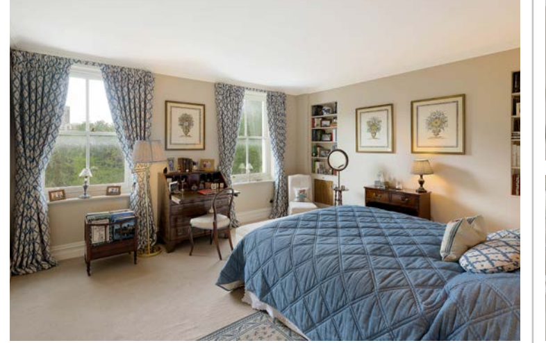
Two Double Bedrooms = Bathroom Shower Room = Reception = Fully Fitted Kitchen Balcony = Lift = 24 Hour Porterage Two Entrances to Building

Royal Court House is situated on the corner of Sloane Street and Cadogan Place, ideally between Knightsbridge and Chelsea and moments away from Sloane Square, and the newly renovated Pavilion Rd with its restaurants and shops.