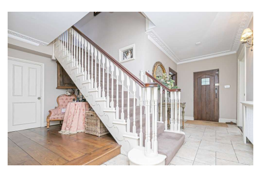
Stanford Rivers Road Marden Ash, Ongar, Essex, CM5 9BT