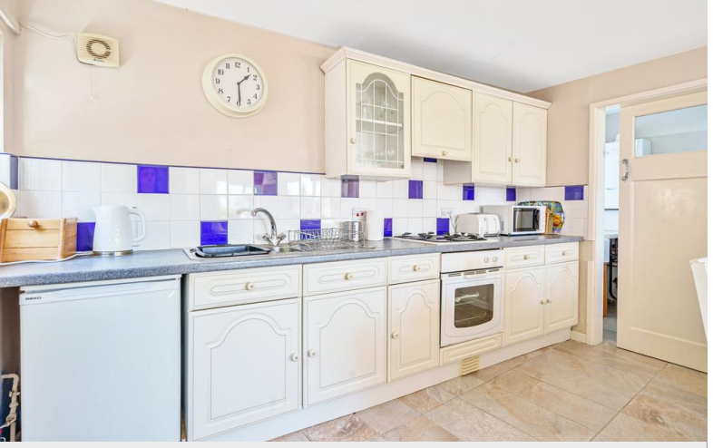
Studio Flat - Breakfast Kitchen