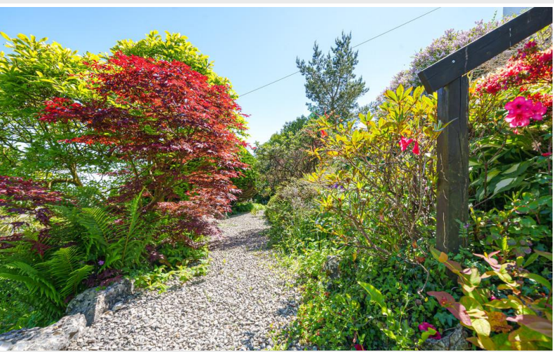
The Chalet - Garden