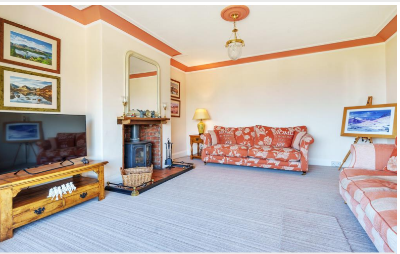
The Chalet - Lounge