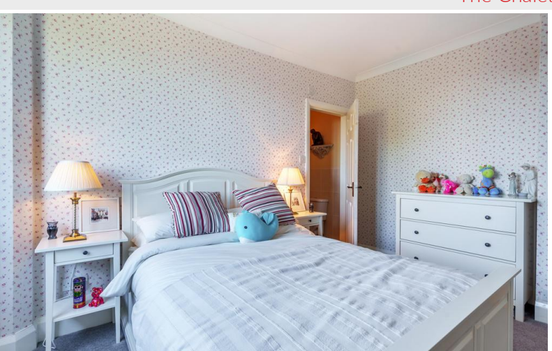
The Chalet - Bedroom 2