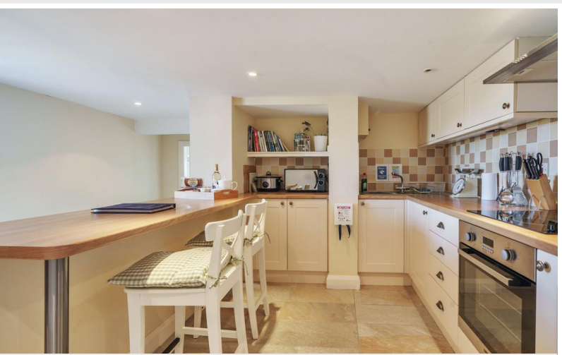
Tides - Breakfasdt Kitchen