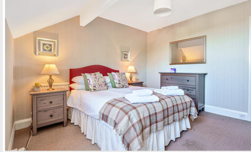
Studio Flat - Bedroom 1