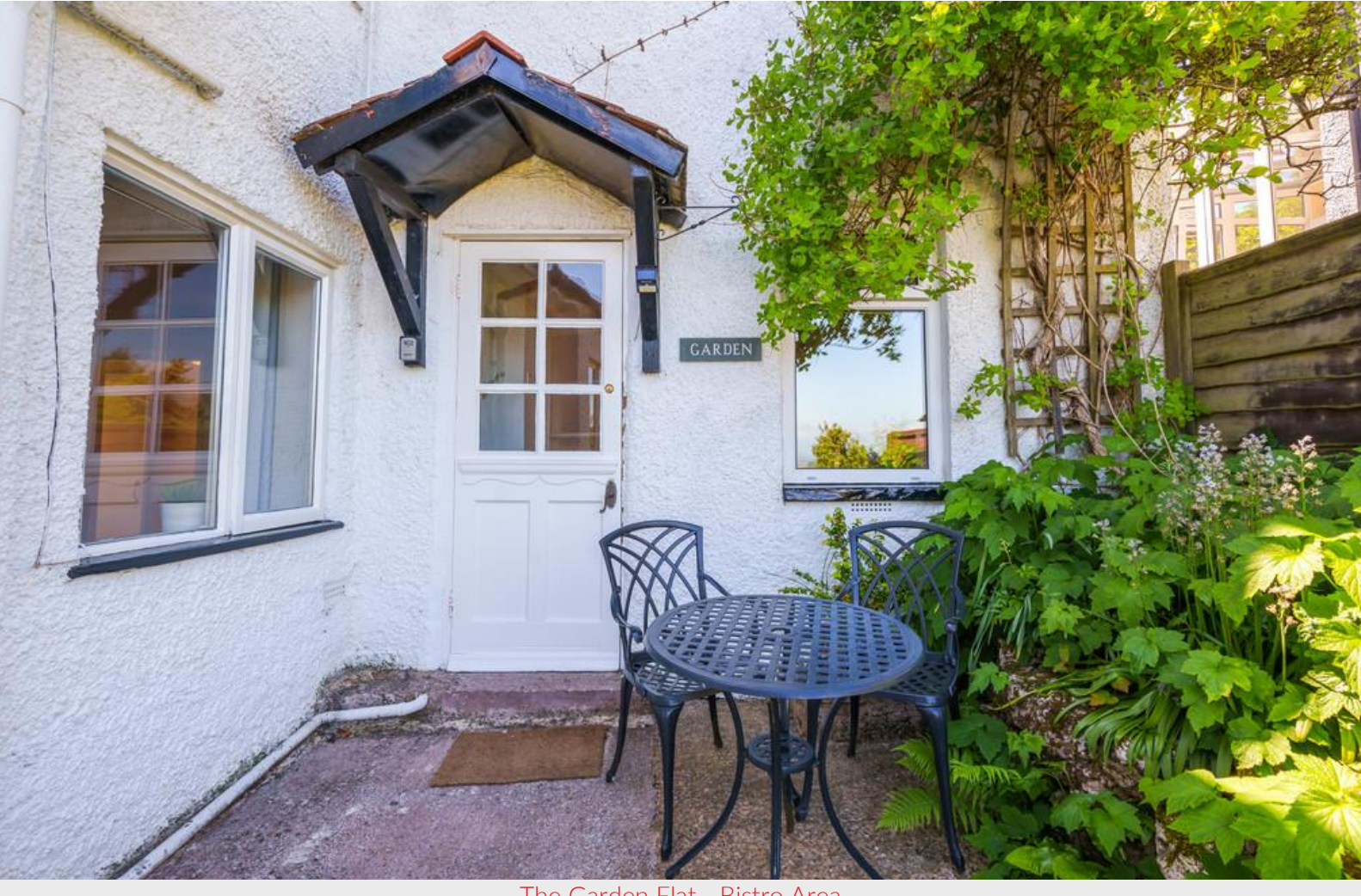
The Garden Flat - Bistro Area