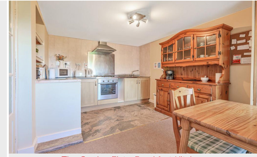
The Garden Flat - Breakfast Kitchen

From the Parking area a pathway to the side of the garage leads you to the Garden Flat. The bistro sitting area gives access to the front door opening to the Breakfast Kitchen where there is a range of base units incorporating the single drainer stainless steel sink unit. Built-in Electrolux oven and hob with cooker hood over; space for washing machine and under counter fridge. Concealed Baxi gas central heating boiler. Door and 3 steps down to the Inner Hall which give access to all rooms. The cosy Sitting Room has a pleasant aspect to the patio area. The Shower Room has a 3 Piece white suite comprising shower enclosure, pedestal wash hand basin and WC. The Bedroom is a good double with a lovely sunny aspect.