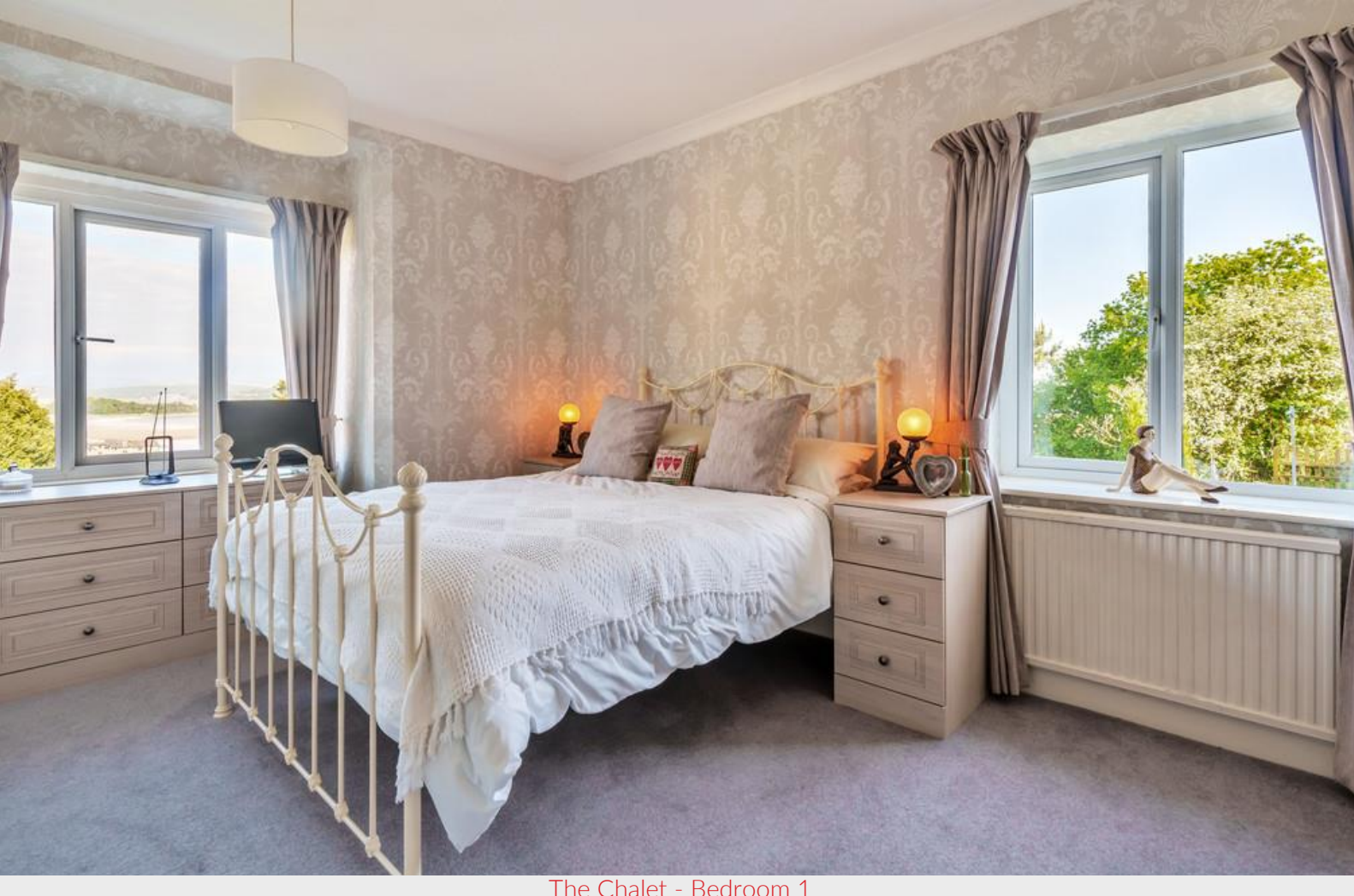
The Chalet - Bedroom 1