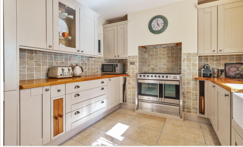
The Chalet - Kitchen

Bedroom 1 is a good sized double with a dual aspect with outstanding views towards the Bay and access to the En-Suite