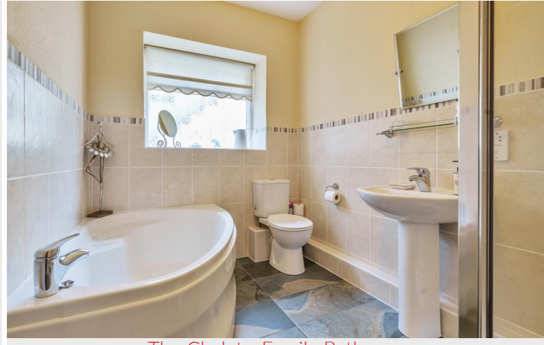
The Chalet - Family Bathroom

To reach the property from Grange-over-Sands proceed up Grange Fell Road past the Library. Just past the 4th right (Eden Mount Road) turn left - signed 'The Chalet'. The property is at the end of the road on the the left hand side.