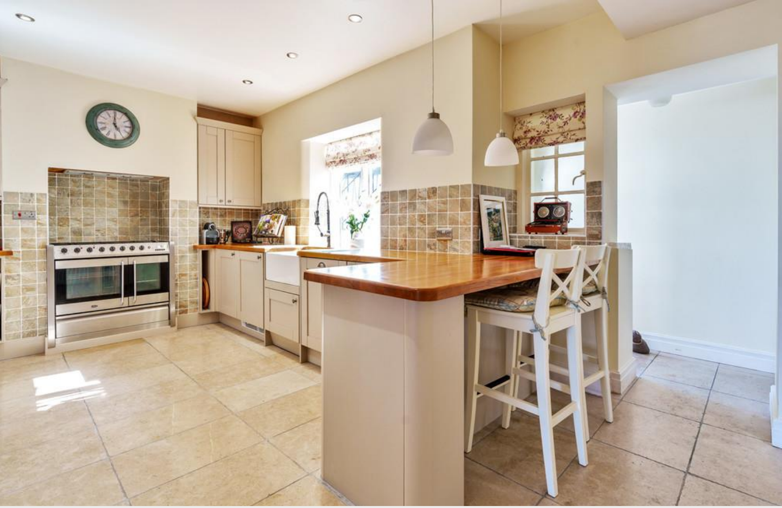
The Chalet - Kitchen