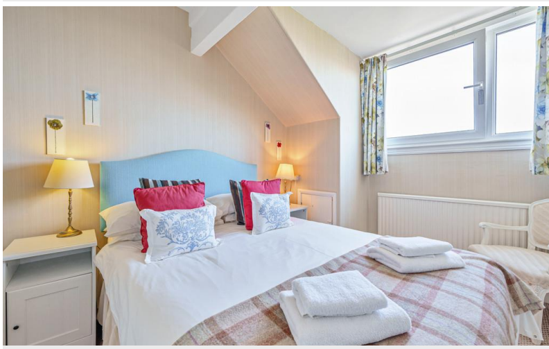
Studio Flat - Bedroom 2