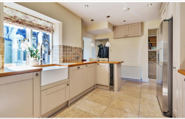
The Chalet - Kitchen