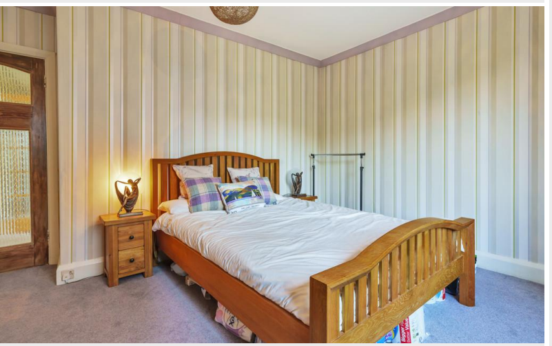
The Chalet - Bedroom 3

Shower Room with 3-piece white suite comprising shower cubicle, wash hand basin and WC.