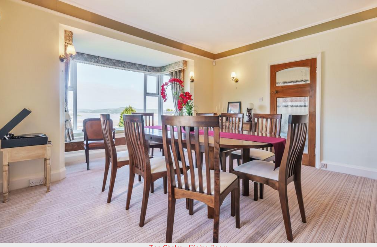
The Chalet - Dining Room