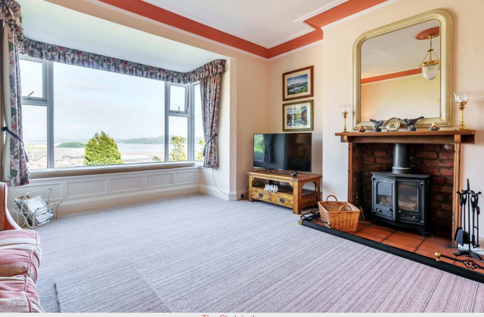
The Chalet - Lounge