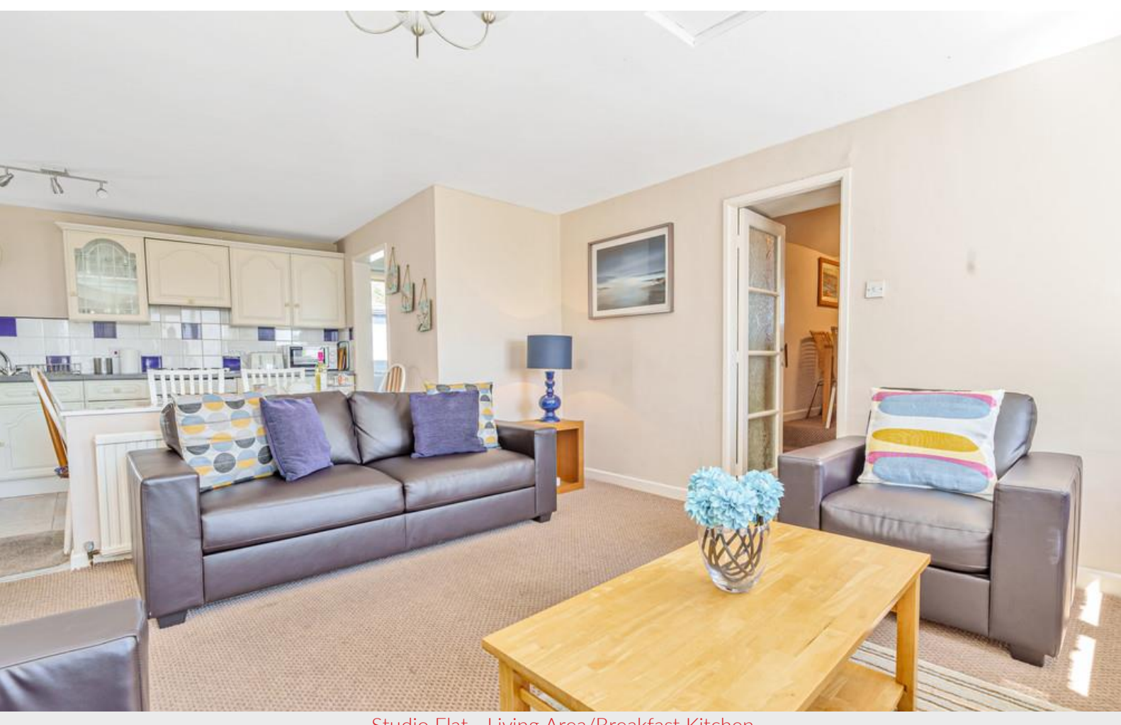
Studio Flat - Living Area/Breakfast Kitchen