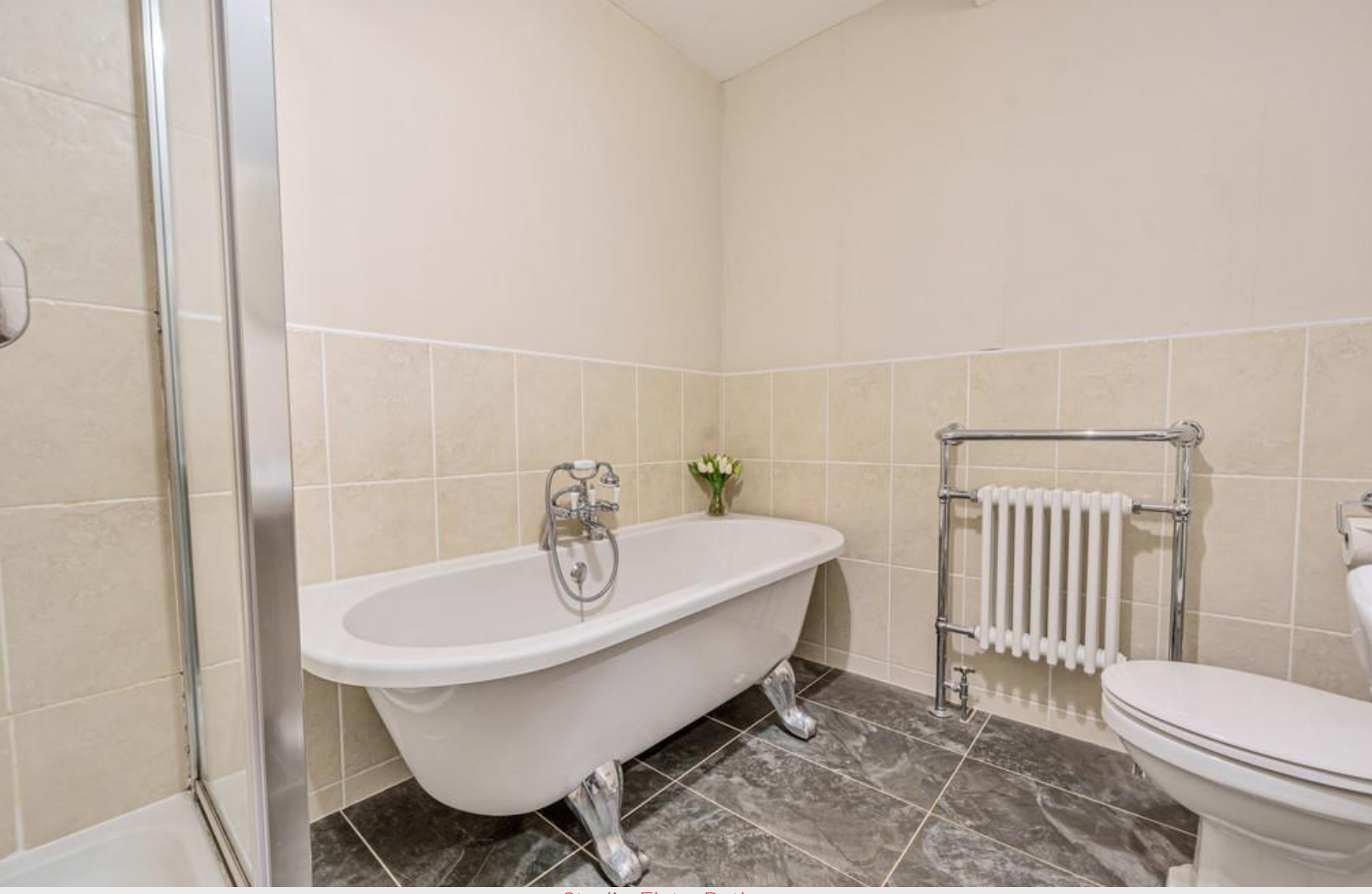
Studio Flat - Bathroom