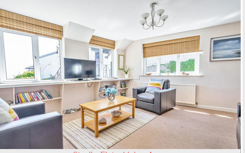
Studio Flat - Living Area