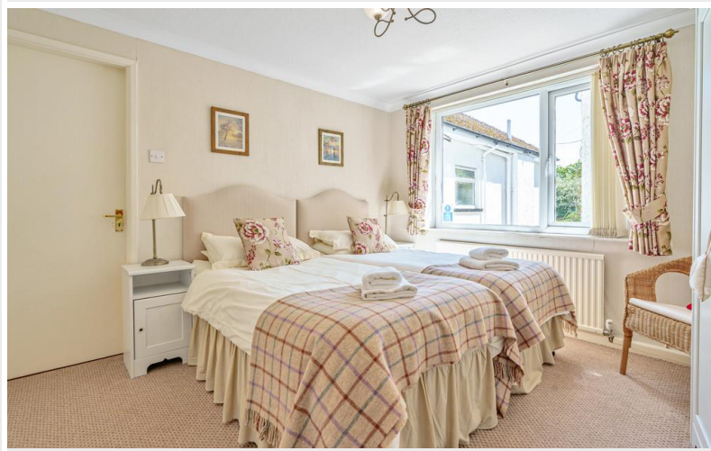
The Garden Flat - Bedroom