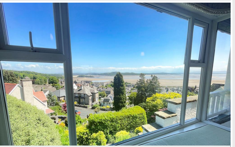
View from Dining Room

Description: In the picturesque town of Grange-over-Sands, there stood a magnificent property, a hidden gem, nestled amidst its delightful gardens and looking out to the breath-taking views of Morecambe Bay and the Fells beyond. This fabulous detached property held within it, immense investment potential.