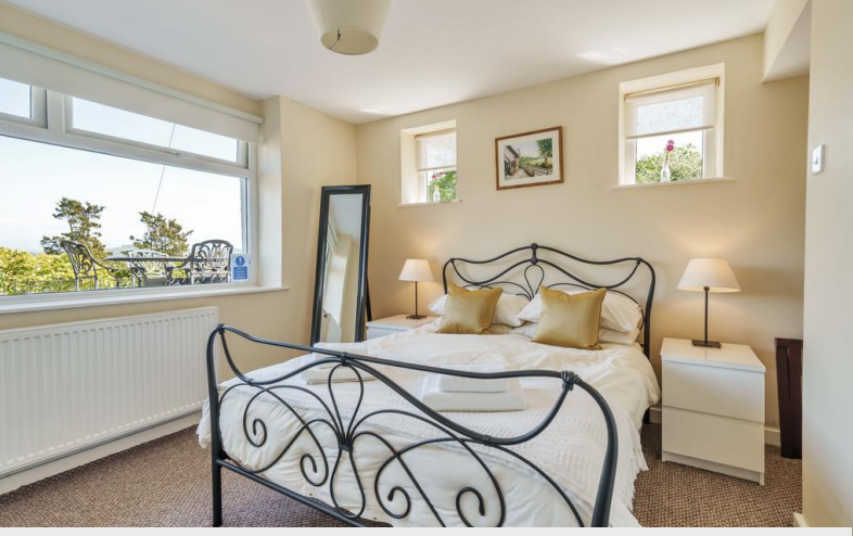
Tides - Bedroom