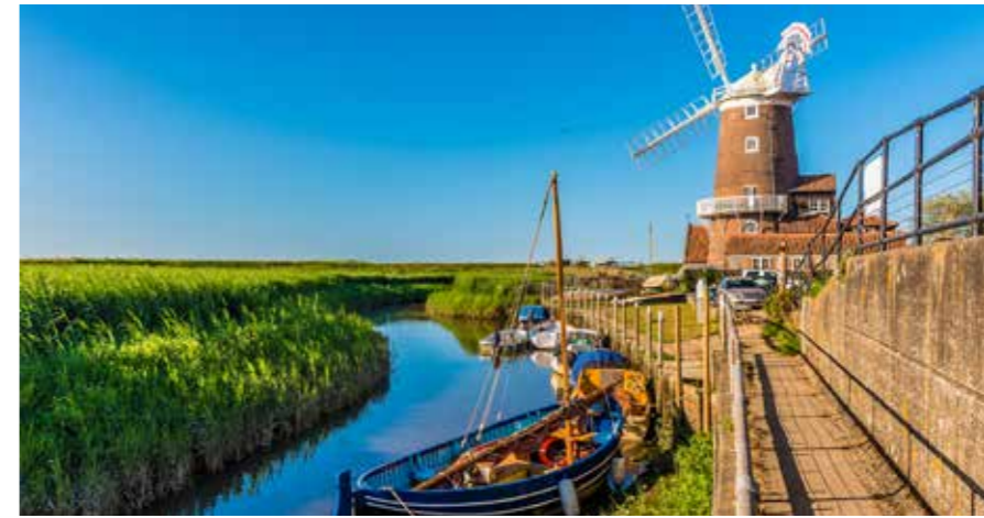
Cley windmill and coastal path

“Thurn Cottage is hidden away from the hustle and bustle of the historic high street, yet just a stone’s throw from the coastal path.”