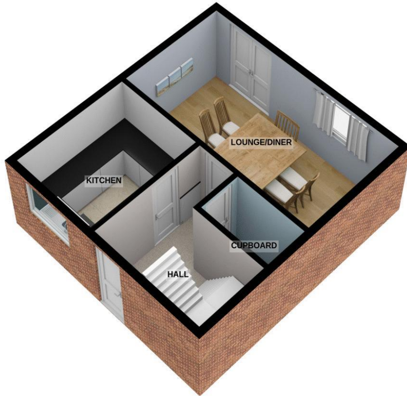
1ST FLOOR 346 sq.ft. (32.1 sq.m.) approx.