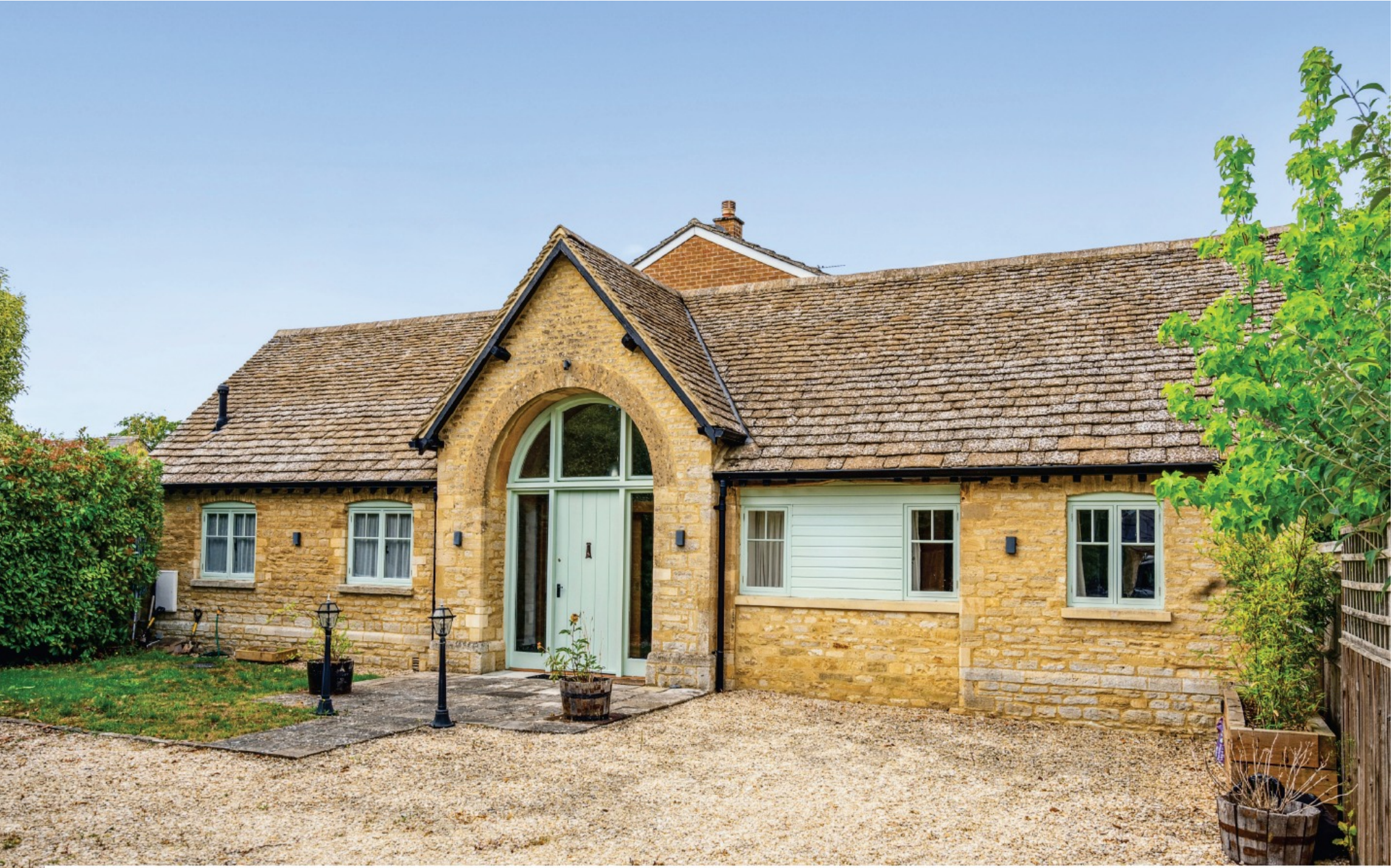
The Coach House, Eynsham