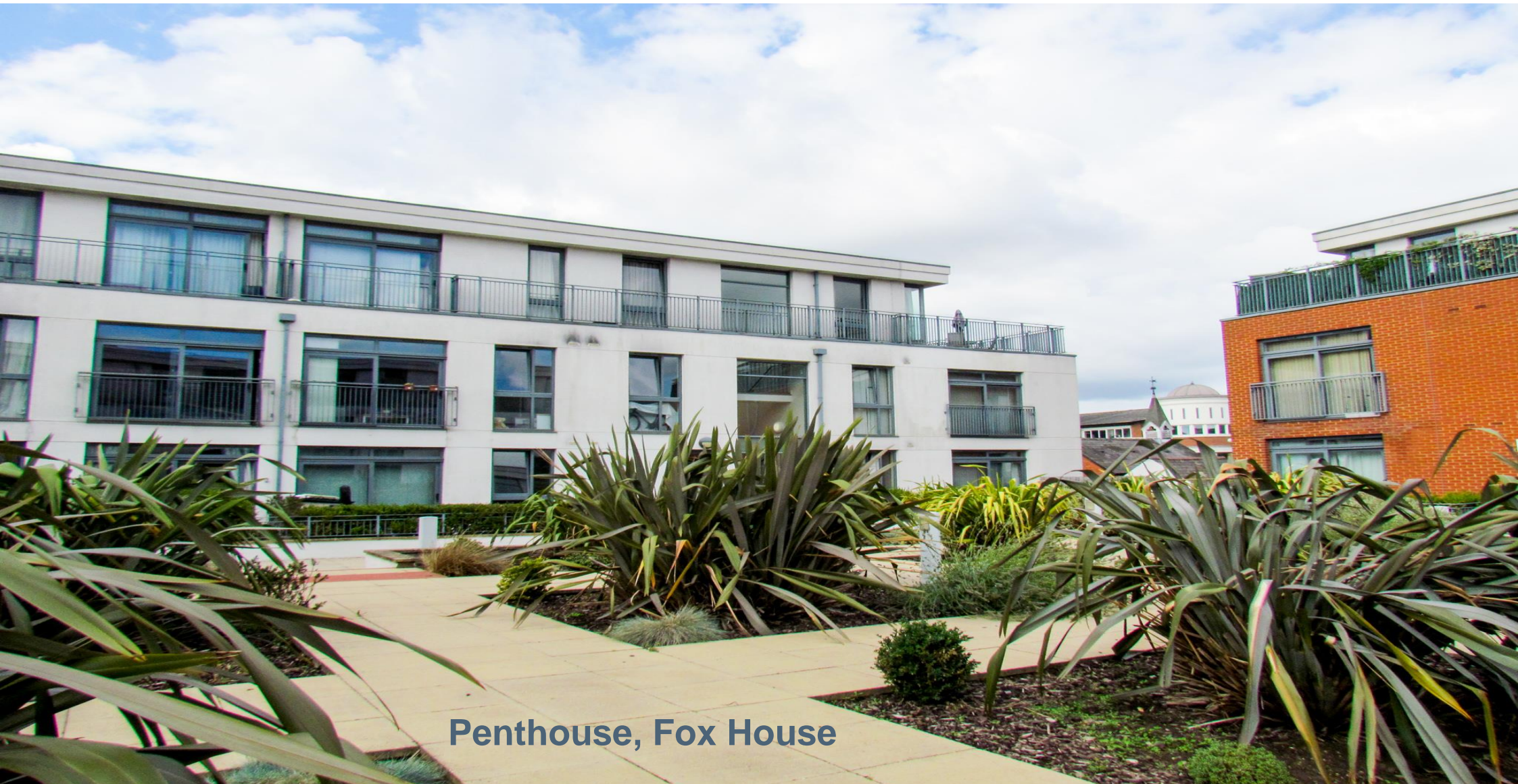
Penthouse, Fox House