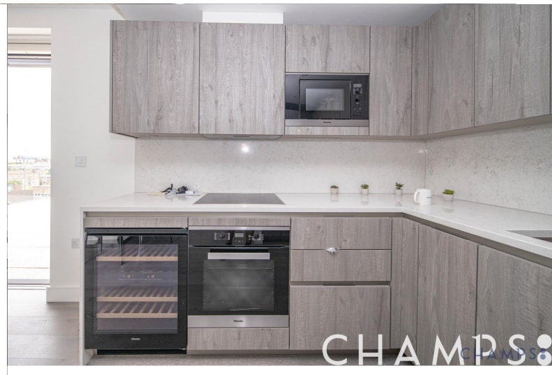
Asking Price £980,000