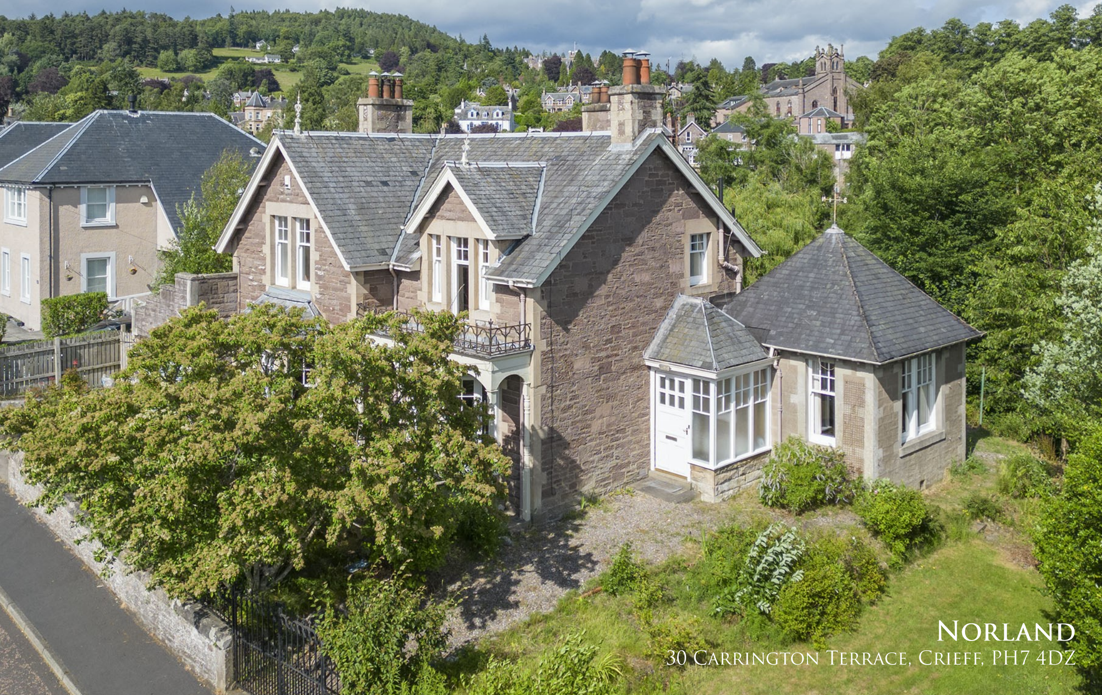
NORLAND 30 CARRINGTON TERRACE, CRIEFF, PH7 4DZ