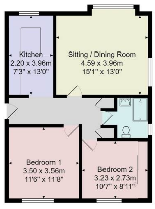
Total Area: 64.3 m² ... 692 ft² All measurements are approximate and for display purposes only. No liability is accepted by either the agency or Box Property Solutions Ltd as to the exact measurements of the rooms. Box Property Solutions Ltd retains the copyright on this plan and allows agents to use it with agreed permission.