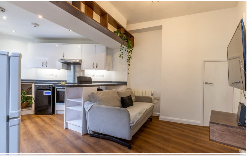
Fitted Kitchen & Living Room

Location: The property can be found on entering Kendal on the one way system into Kirkland. Number 7 is located on your right hand side just up from the Parish Church, opposite the Wheatsheaf apartments.