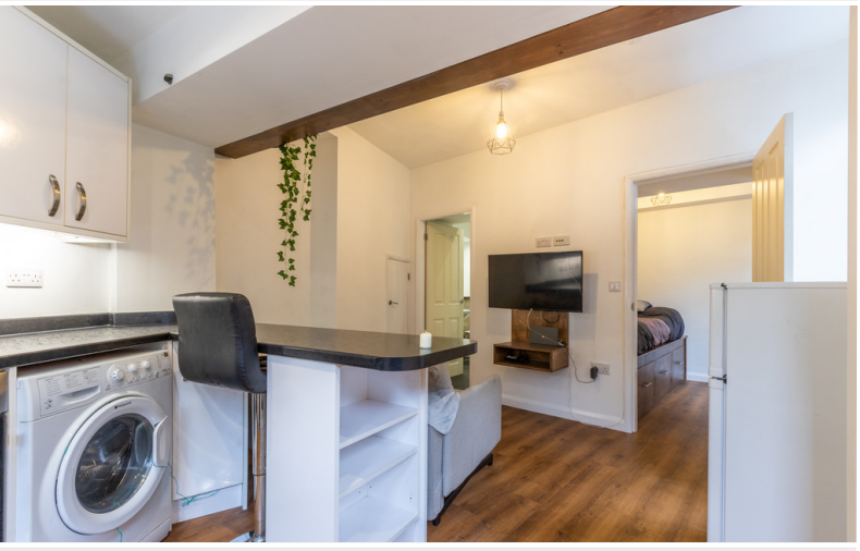
Fitted Kitchen & Living Room