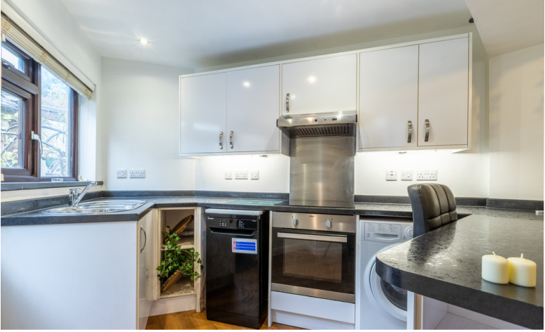
Fitted Kitchen Area