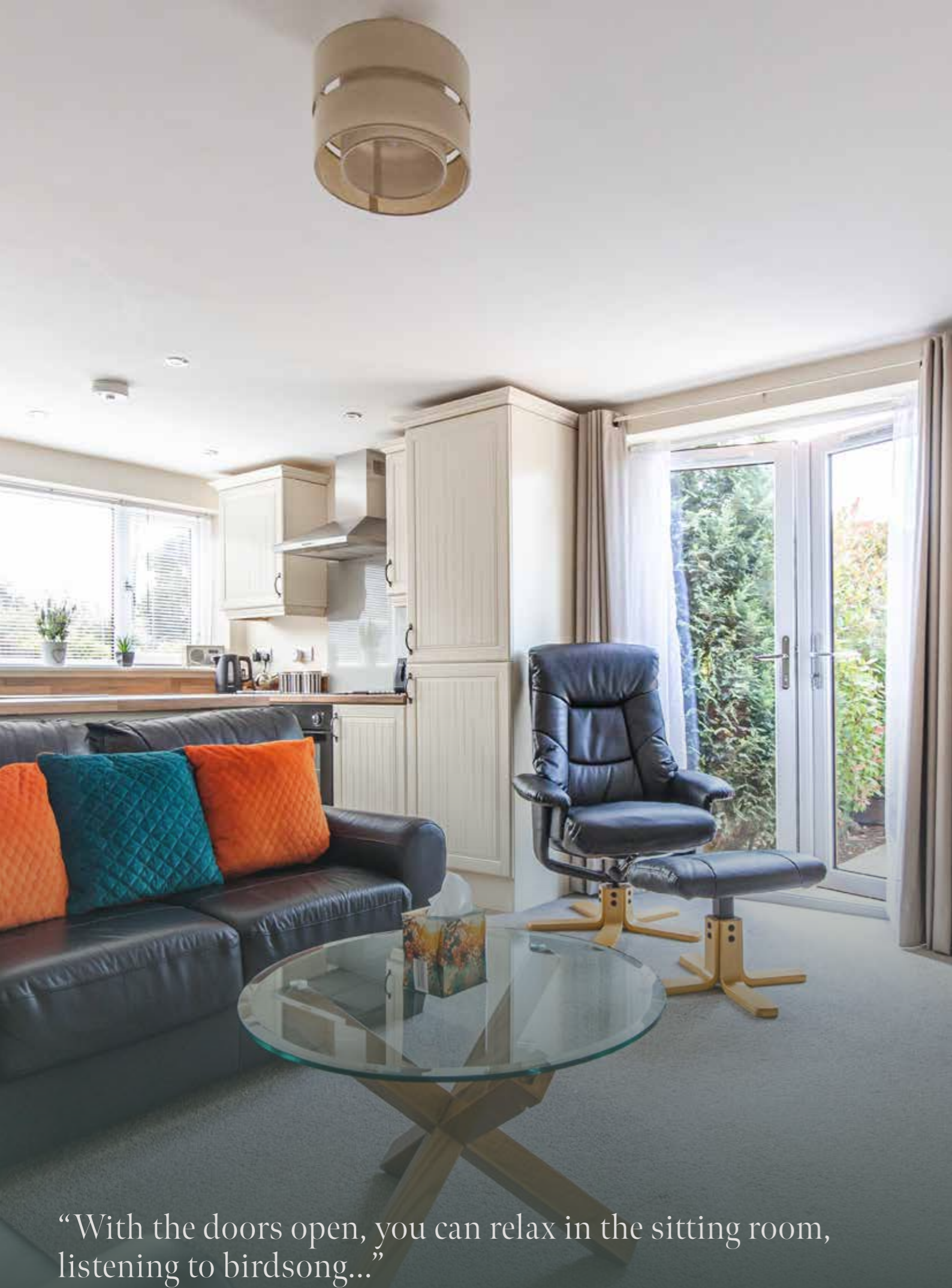
“With the doors open, you can relax in the sitting room, listening to birdsong...”