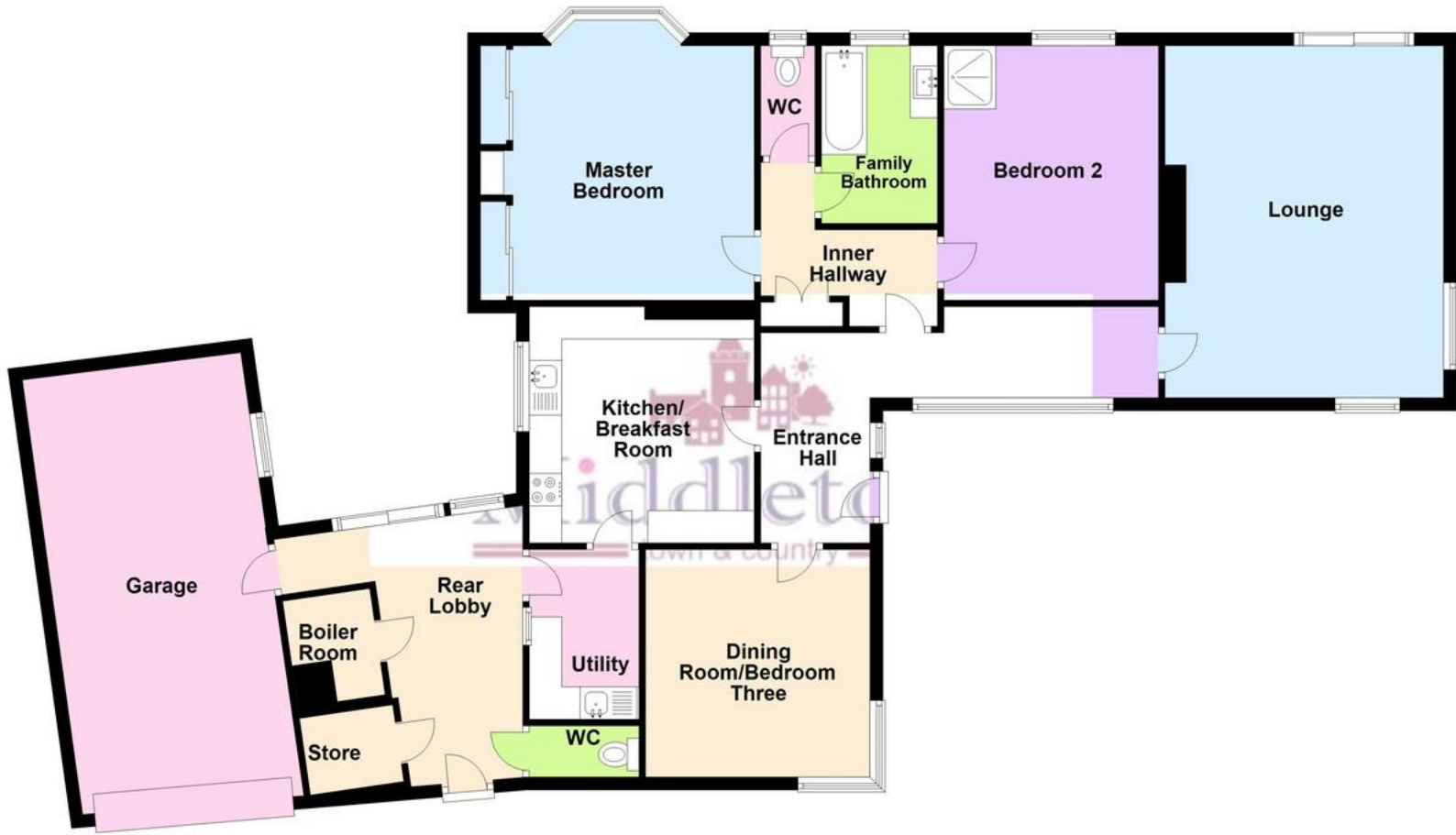
This floorplan has been produced by Middletons as a guide only. For further information call 01664 566258 Plan produced using PlanUp.