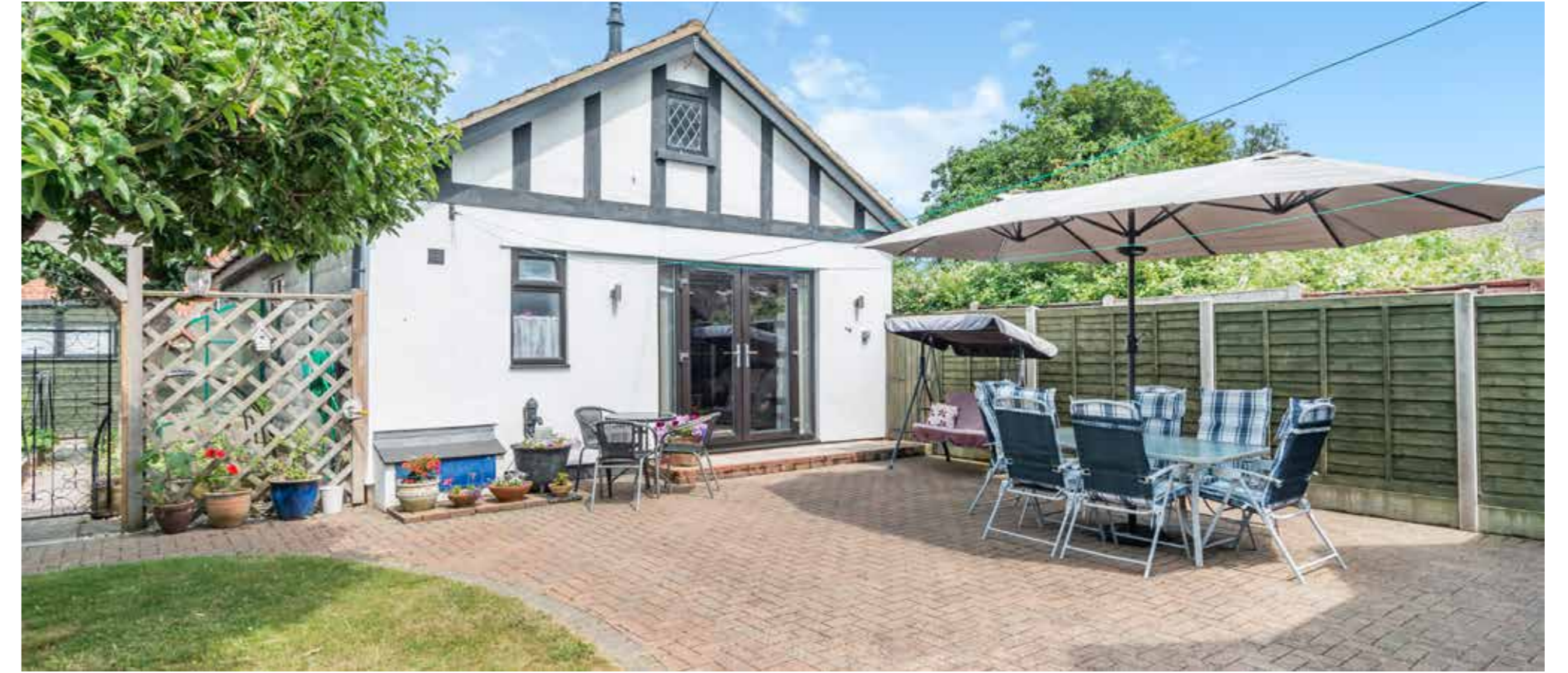
The meticulously converted annexe has had a long and interesting history. When originally built, it served as a Catholic church, then a bakery after the war, then as part of a builder's yard and finally as an upholstery workshop. Now it has a very spacious open plan reception room with plenty of space for a table and chairs, a smart kitchenette, a shower room with an Aqualisa shower and a pair of double doors leading out to a sunny seating area.