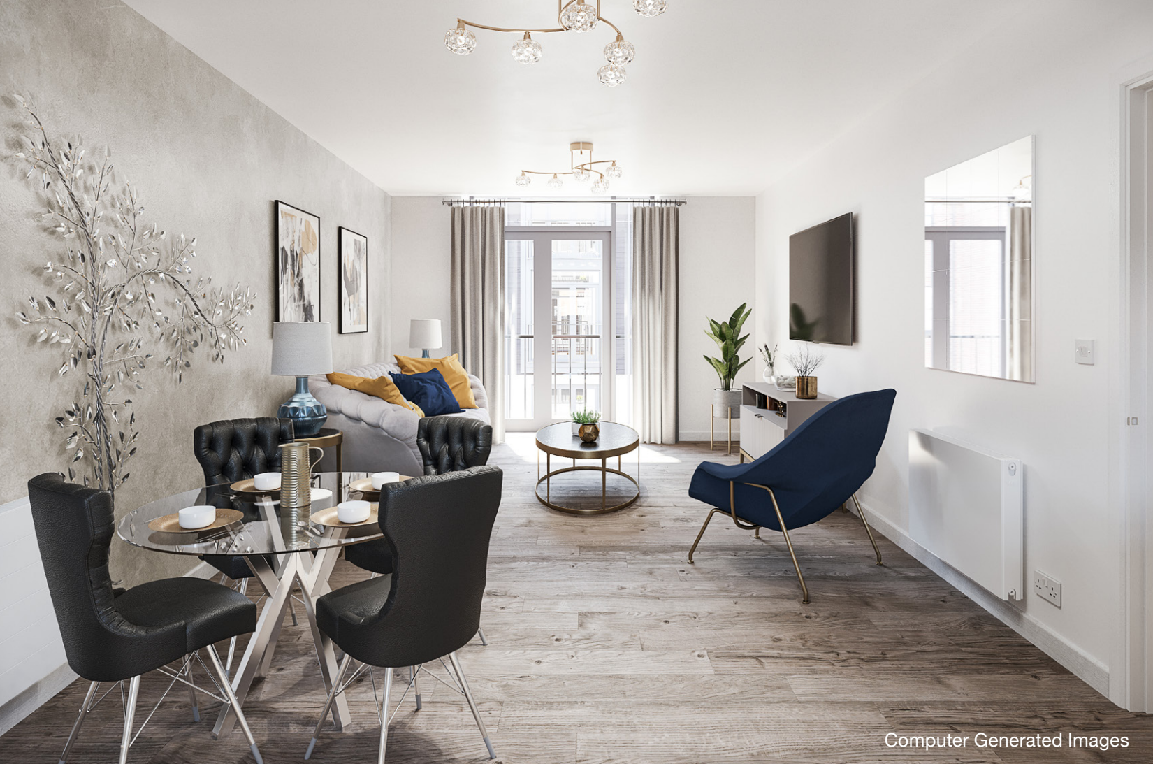
Computer Generated Images