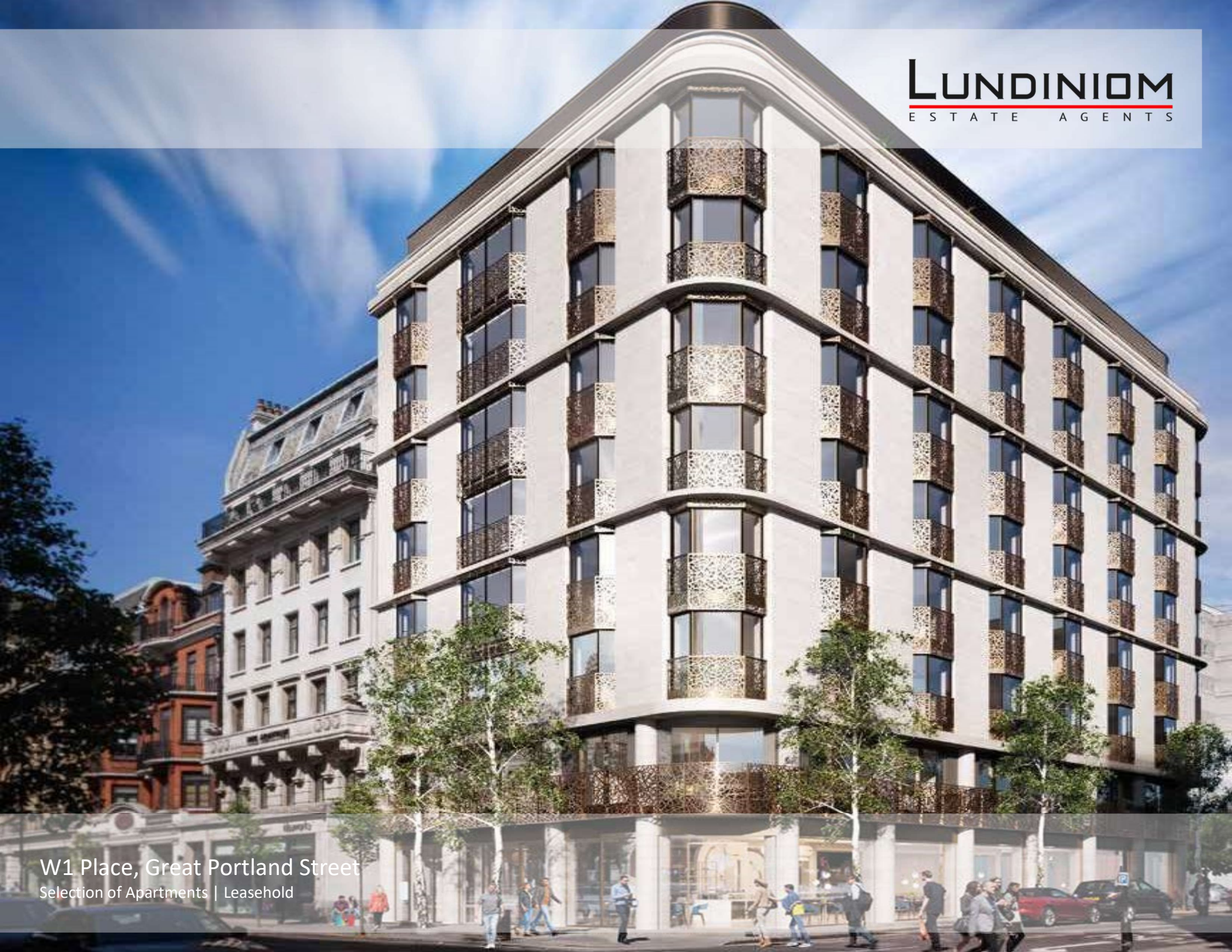
W1 Place, Great Portland Street Selection of Apartments | Leasehold