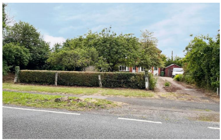
Land to Side