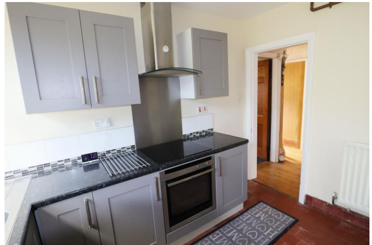
Utility 15' 3" (4.65m) x 7' 0" (2.13m)