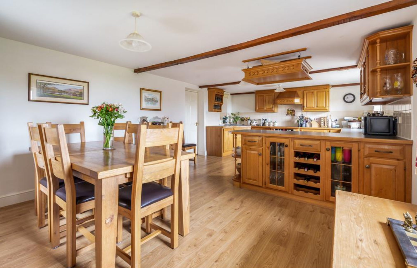
Kitchen Dining Room