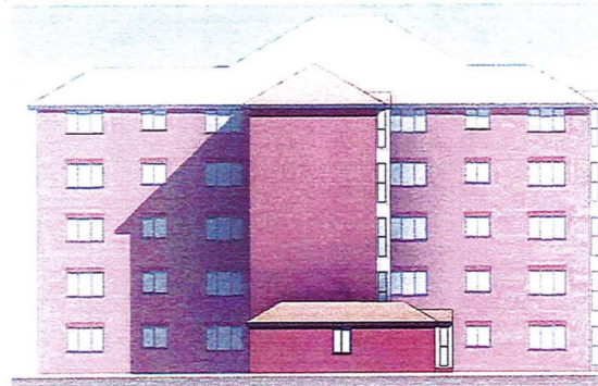
4 Elevation 2 - a 1:100

PLANNING 1:1000 1:500 1:200 1:100 1:50 1:20 1:10 1:5 1:2 1:1