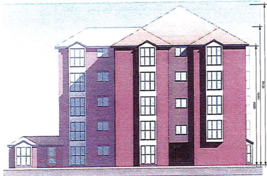
1 Elevation 1 - a 1:100