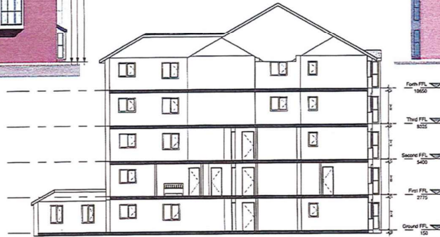
5 Section 1 1:100