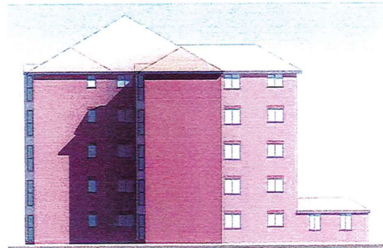
2 Elevation 4 - a 1:100