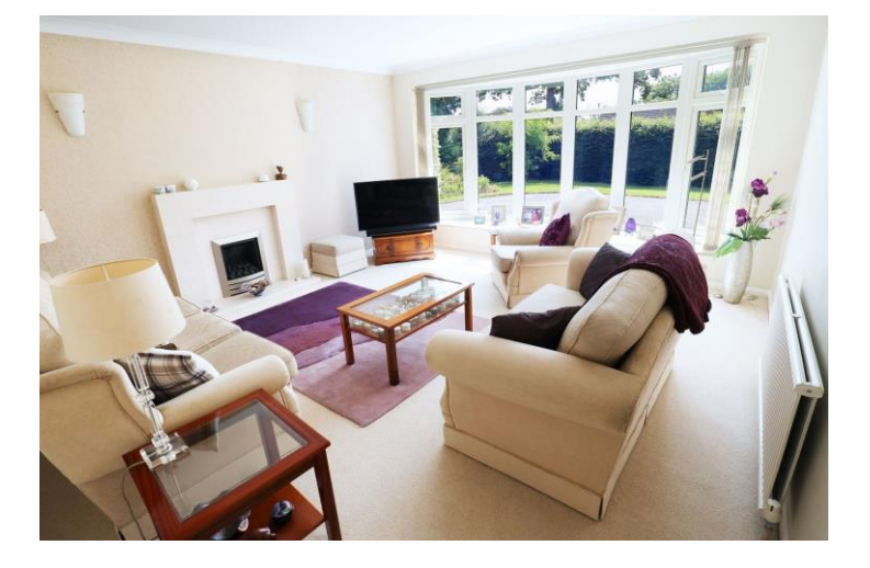
Sitting Room 10' 10'' (3.3m) x 10' 8'' (3.25m)