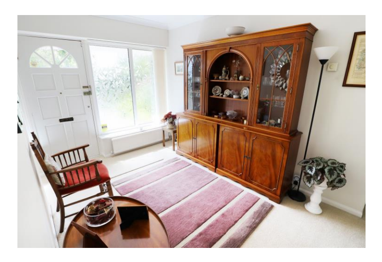
Lounge 15' 10'' (4.83m) x 14' 8'' (4.47m)