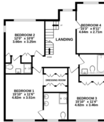
1ST FLOOR 966 sq.ft. (89.7 sq.m.) approx.