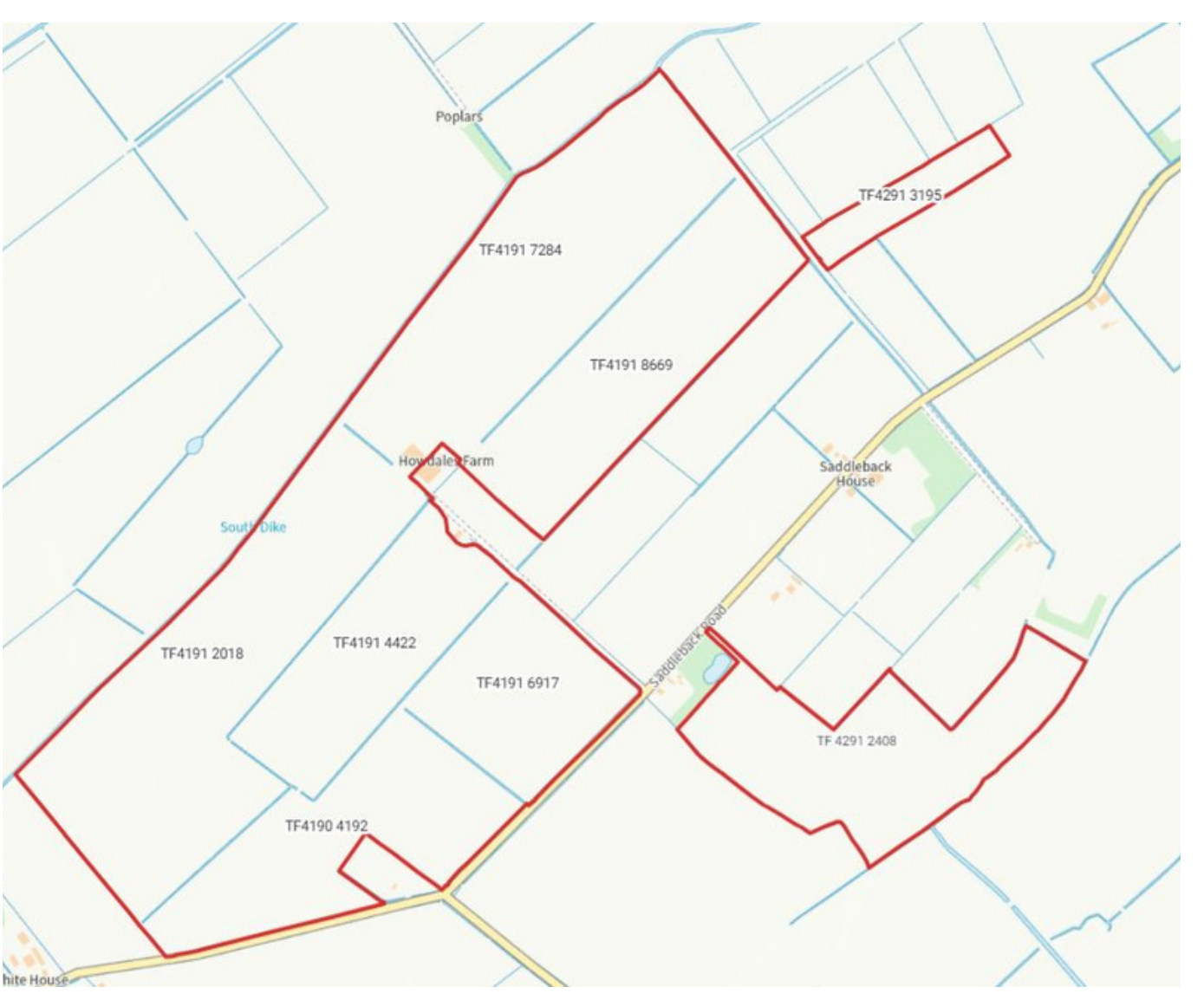
Lot 1 - Land at Howdales Farm - 206.12ac (83.41ha)

The landlord will be responsible for insuring the buildings. The incoming tenant will be responsible for all other outgoings and will be responsible for maintaining the buildings in good tenantable condition.