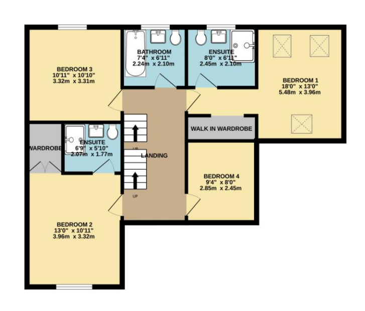
2ND FLOOR 347 sq.ft. (32.3 sq.m.) approx.