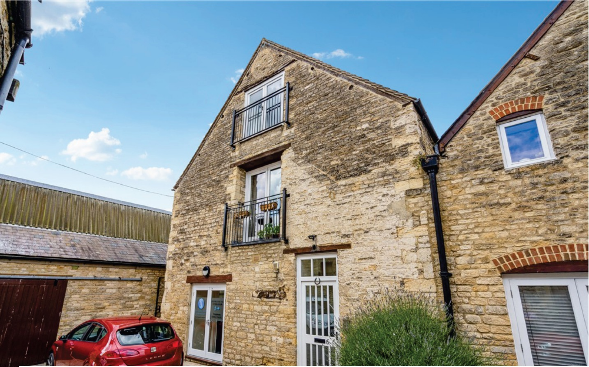
Bridge Street Mills, Witney