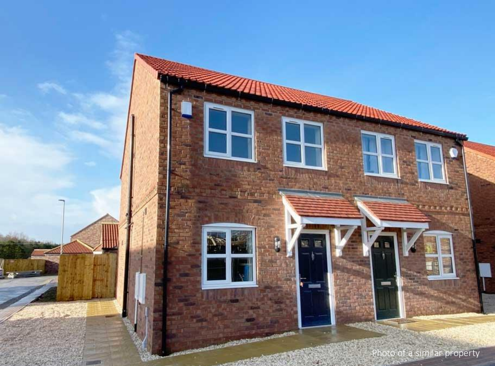
Photo of a similar property