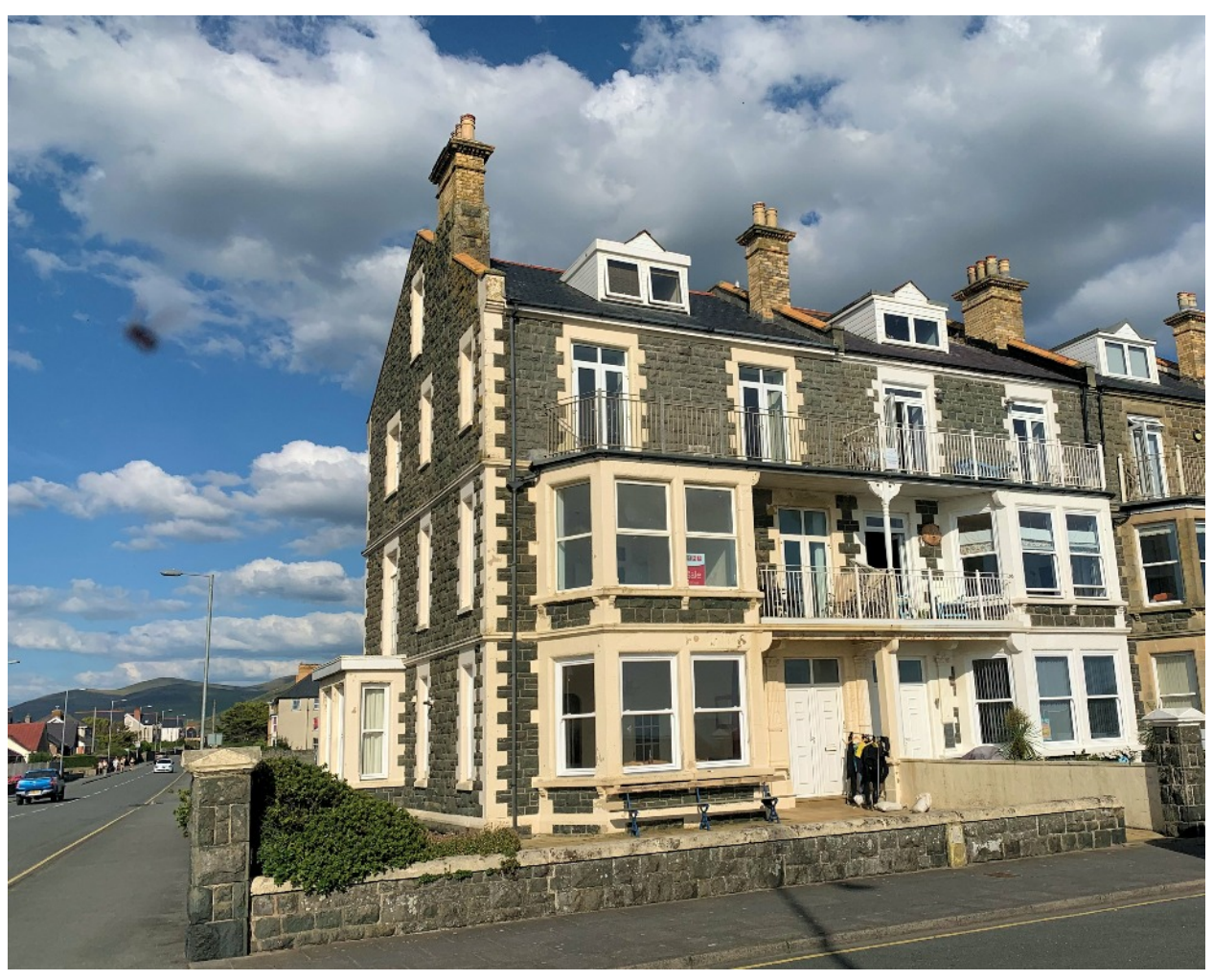
Spacious 2nd floor apartment with uninterrupted sea views and a balcony 3 bedrooms Close to all amenities Communal front garden, rear parking

Offers in the region of £169,000 Share of leasehold