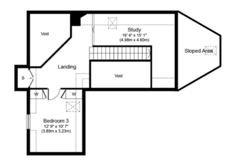
First Floor Approximate Floor Area 591 sq. ft. (54.9 sq. m.)