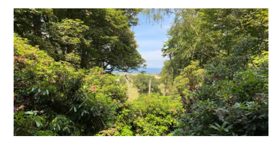
Sheringham Park offers countryside walks, despite being so close to the seasisde

"We've enjoyed the local area for a range of walks. Whether it's been Wells, Holkham, Kelling Heath or Sheringham Park."