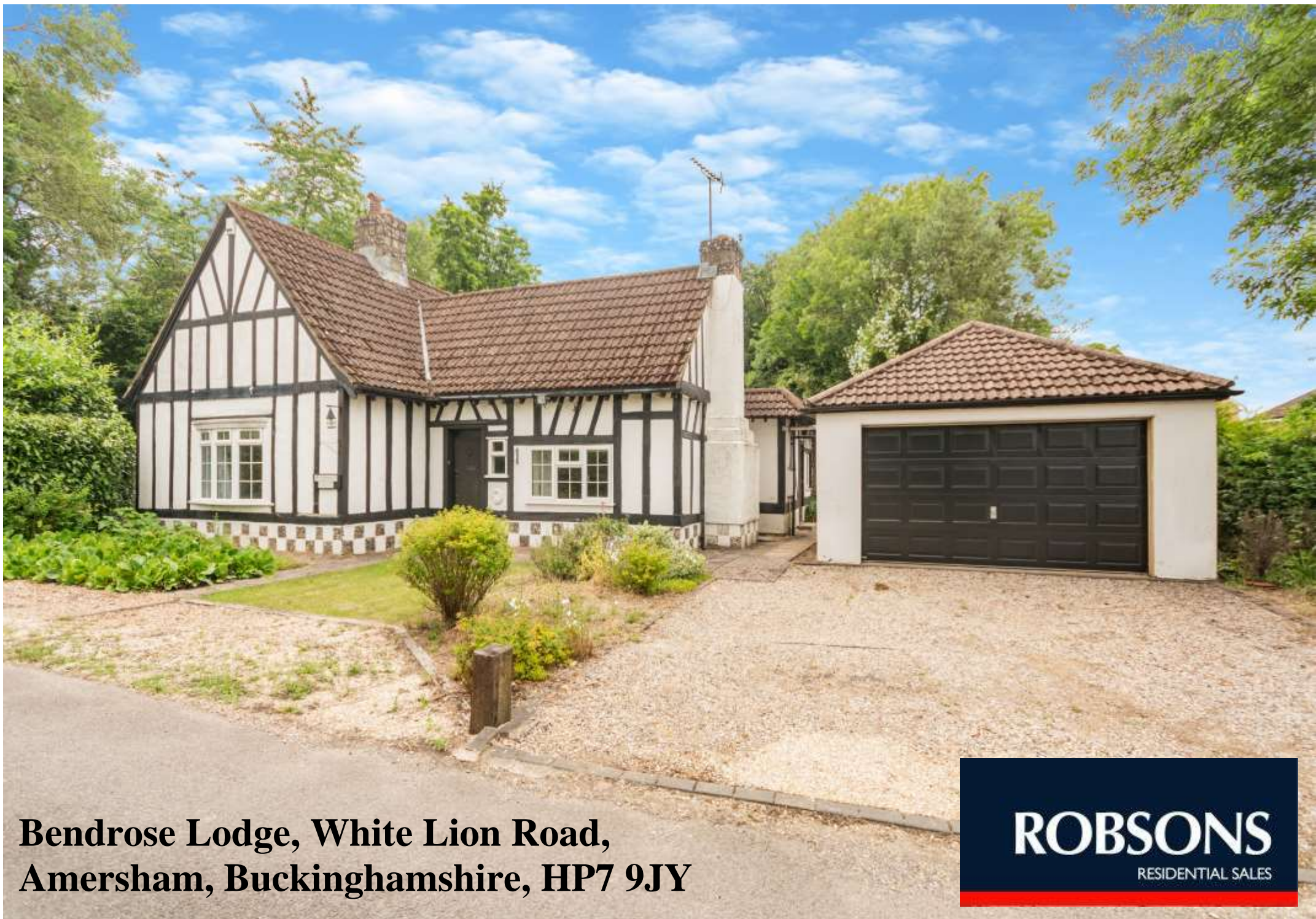
Bendrose Lodge, White Lion Road, Amersham, Buckinghamshire, HP7 9JY