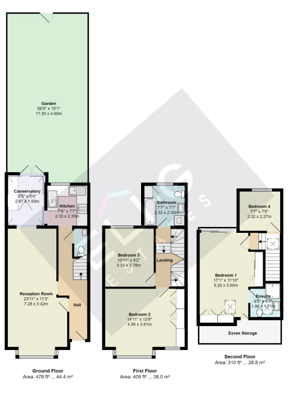
Alexandra Road NW4 Total Area: 1197 ft² ... 111.2 m² Al measurements are approximate and for display purposes only