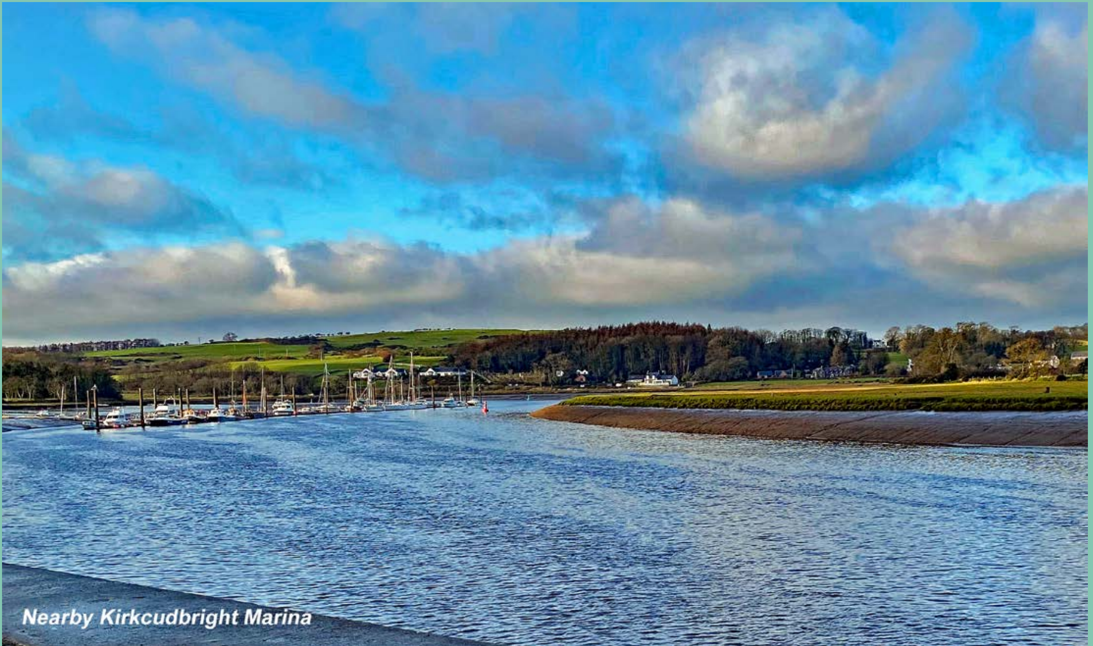
Nearby Kirkcudbright Marina