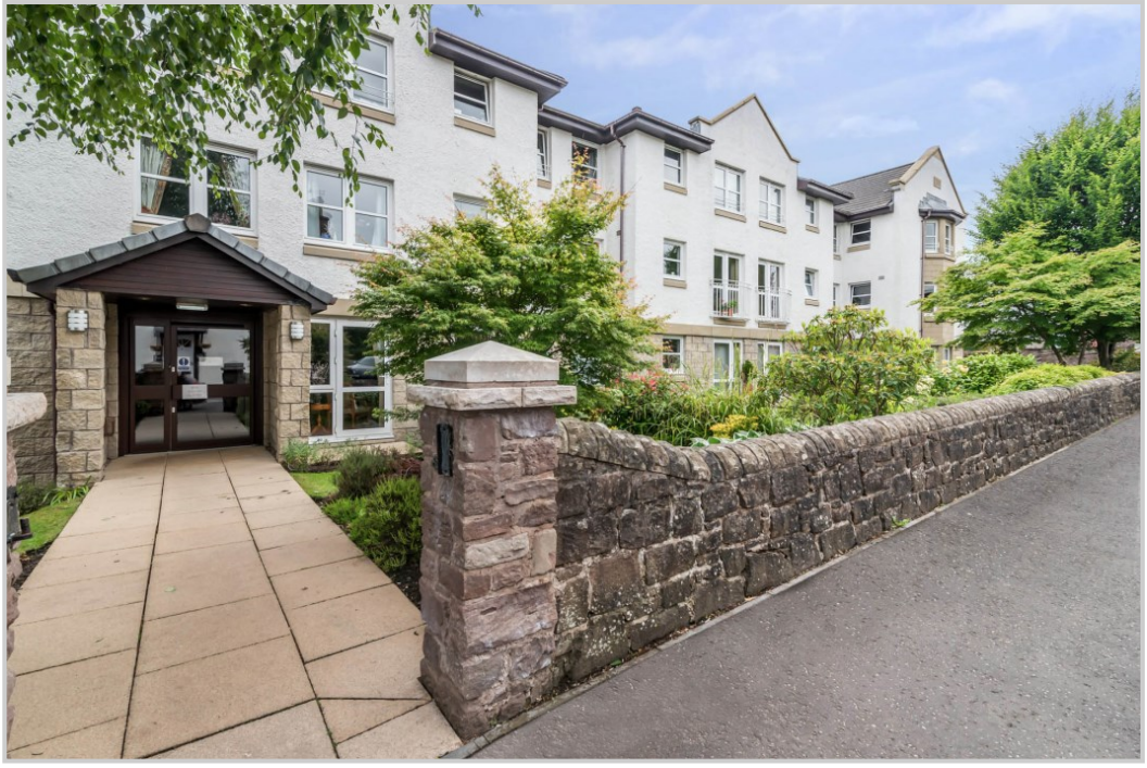
These particulars are believed to be correct, but their accuracy is not guaranteed and they do not form part of any contract. All measurements shown are approximate only.