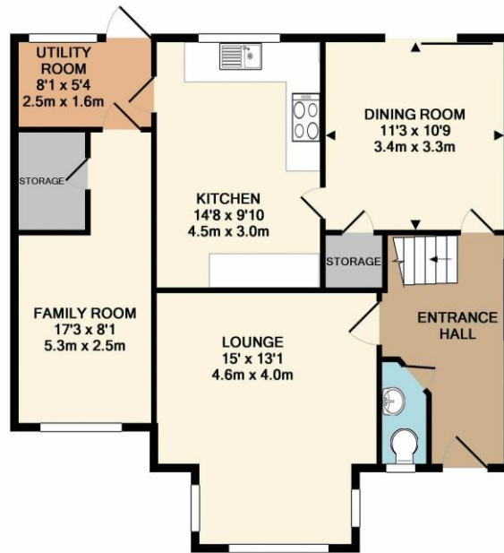
GROUND FLOOR APPROX. FLOOR AREA 739 SQ.FT. (68.7 SQ.M.)