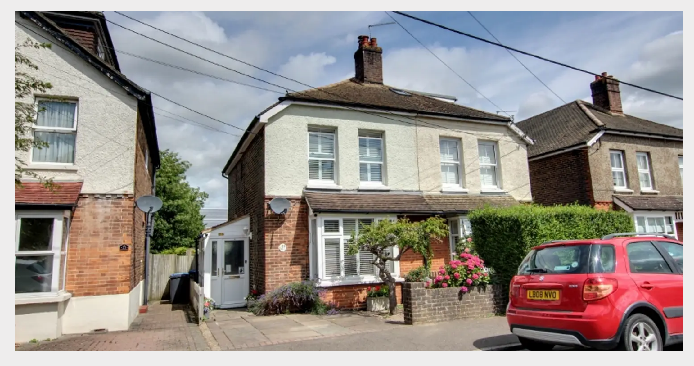
23 Gordon Road, Haywards Heath, West Sussex RH16 1EL