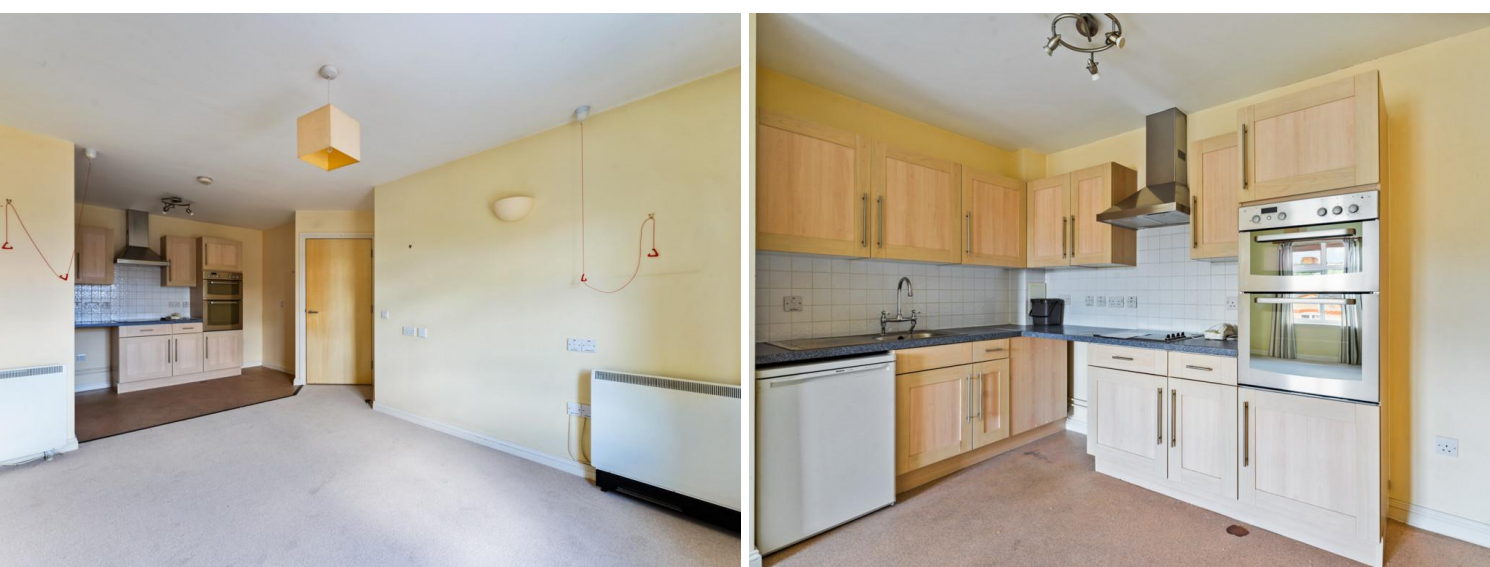
21 Moorlands, 17 Beddington Gardens, Wallington, Surrey, SM6 0JF | £215,000 Leasehold

Located in a popular residential Over 60's development which is just a short walk from the town centre with its range of shops and amenities, this 2nd floor apartment boasts an open plan lounge/dining/kitchen area, two bedrooms and spacious wet room. Features include 24 house emergency careline, residents lift, x2 residents lounge/games room, laundry and well maintained communal gardens. No chain.