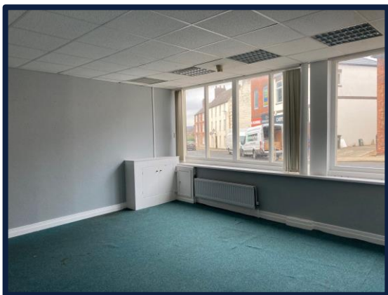
Ground floor office