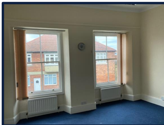
Typical first floor office

Interested parties should make enquiries direct with the Local Authority to establish the actual rates payable.