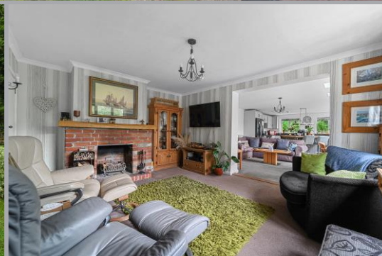
Garden Cottage | 28 Forest Road | Onehouse | IP14 3EW

Specialist marketing for | Barns | Cottages | Period Properties | Executive Homes | Town Houses | Village Homes