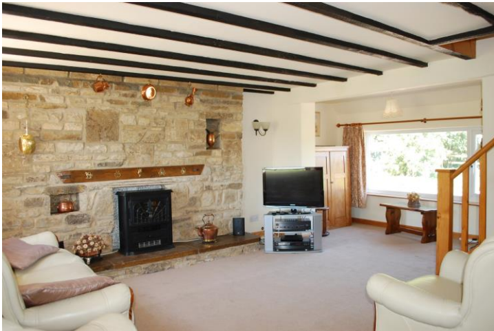
Lounge/Diner L-Shaped 18' 1" (5.51m) x 15' 4" (4.67m)