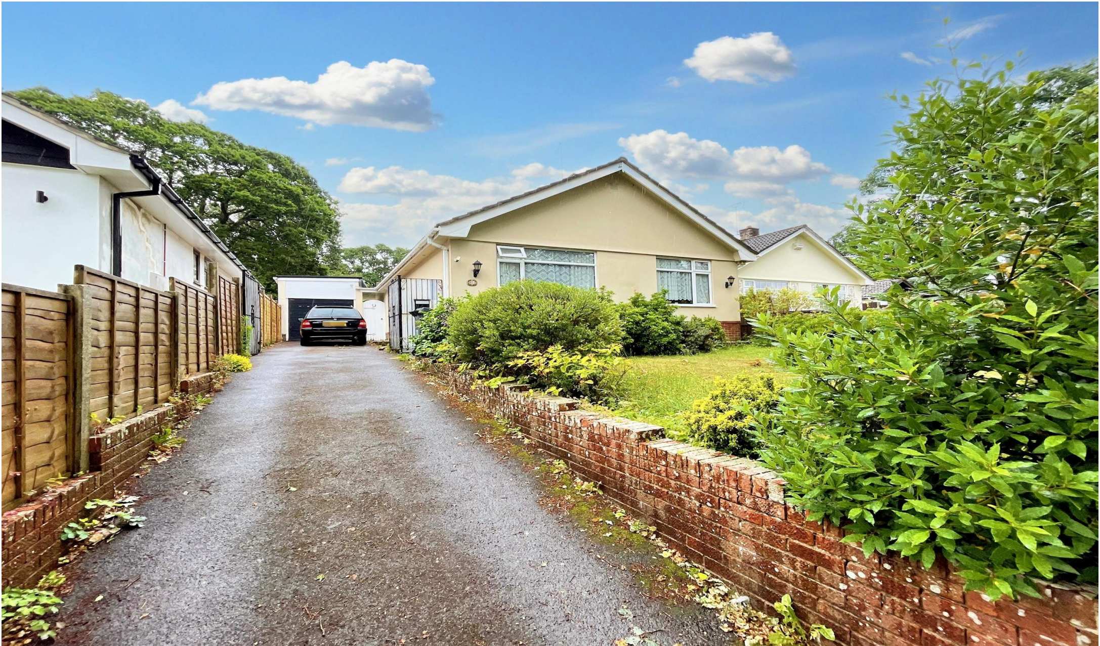
Knighton Heath Road, Bournemouth, Dorset