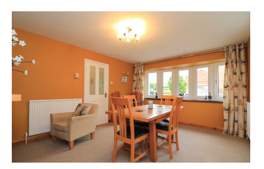
West Drive £510,000

Bonehill, Tamworth, Staffordshire, B78 3HR