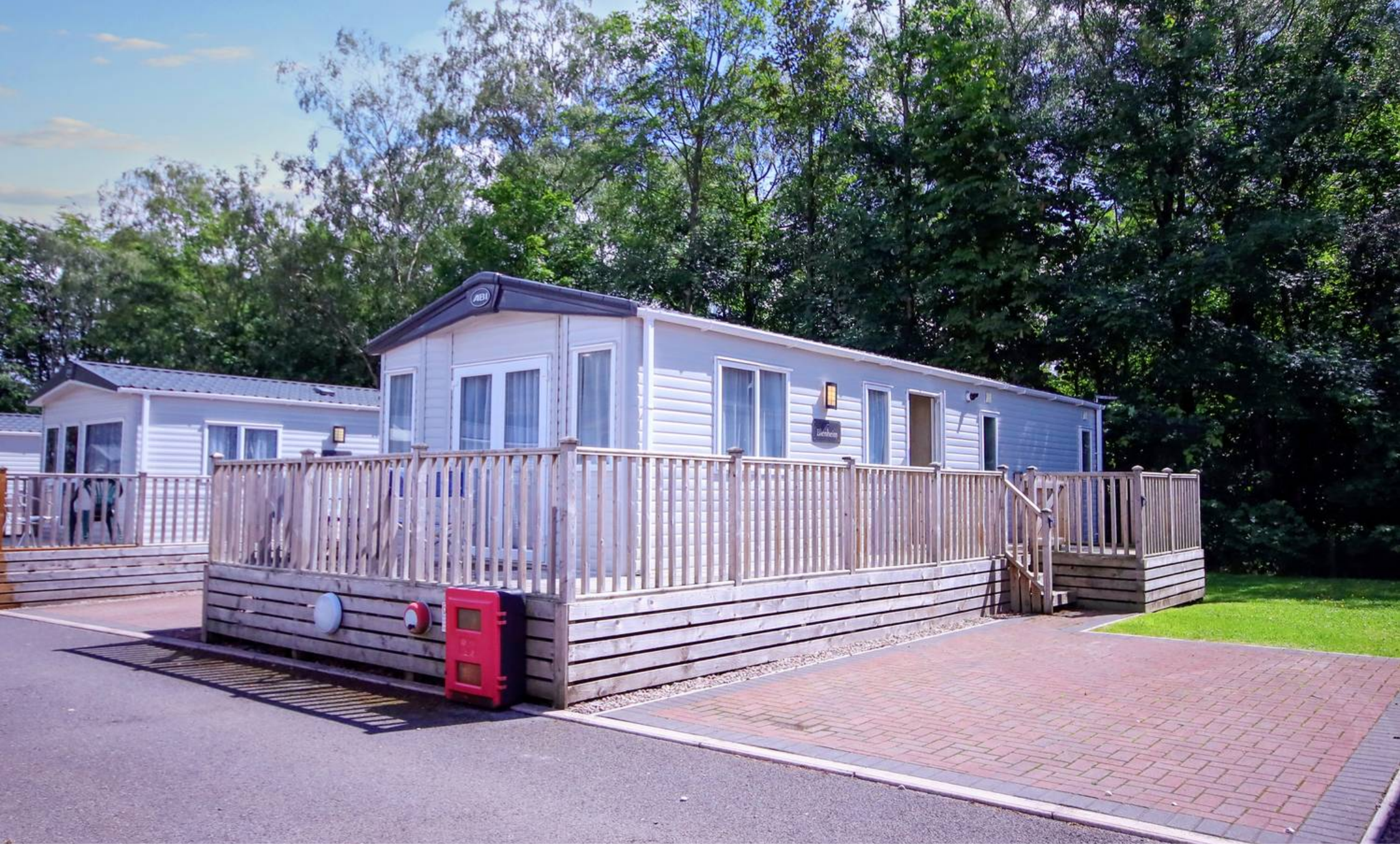
The Blenheim, Camelot Holiday Park, Longtown - CA6 5SZ Guide Price £30,000