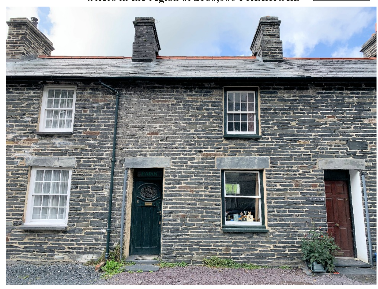
Grade 2 listed 2 bedroom cottage of character Oil centrally heated Oil Aga In need of some refurbishment Enclosed rear garden

Offers in the region of £160,000 FREEHOLD