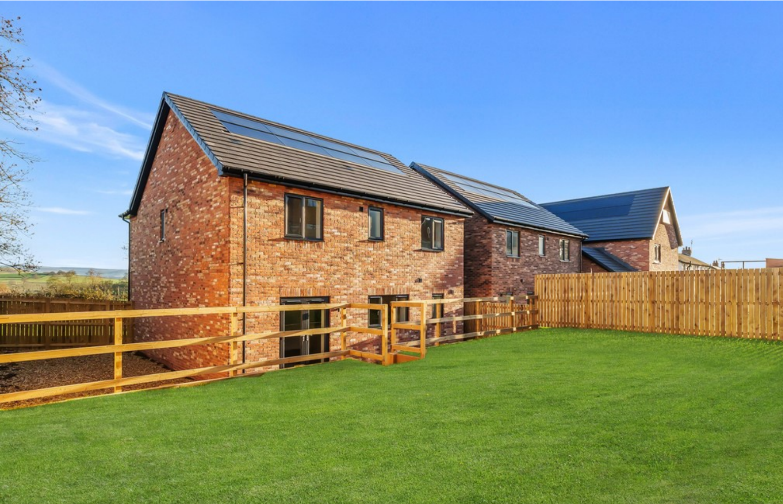
Rear Elevation and Garden